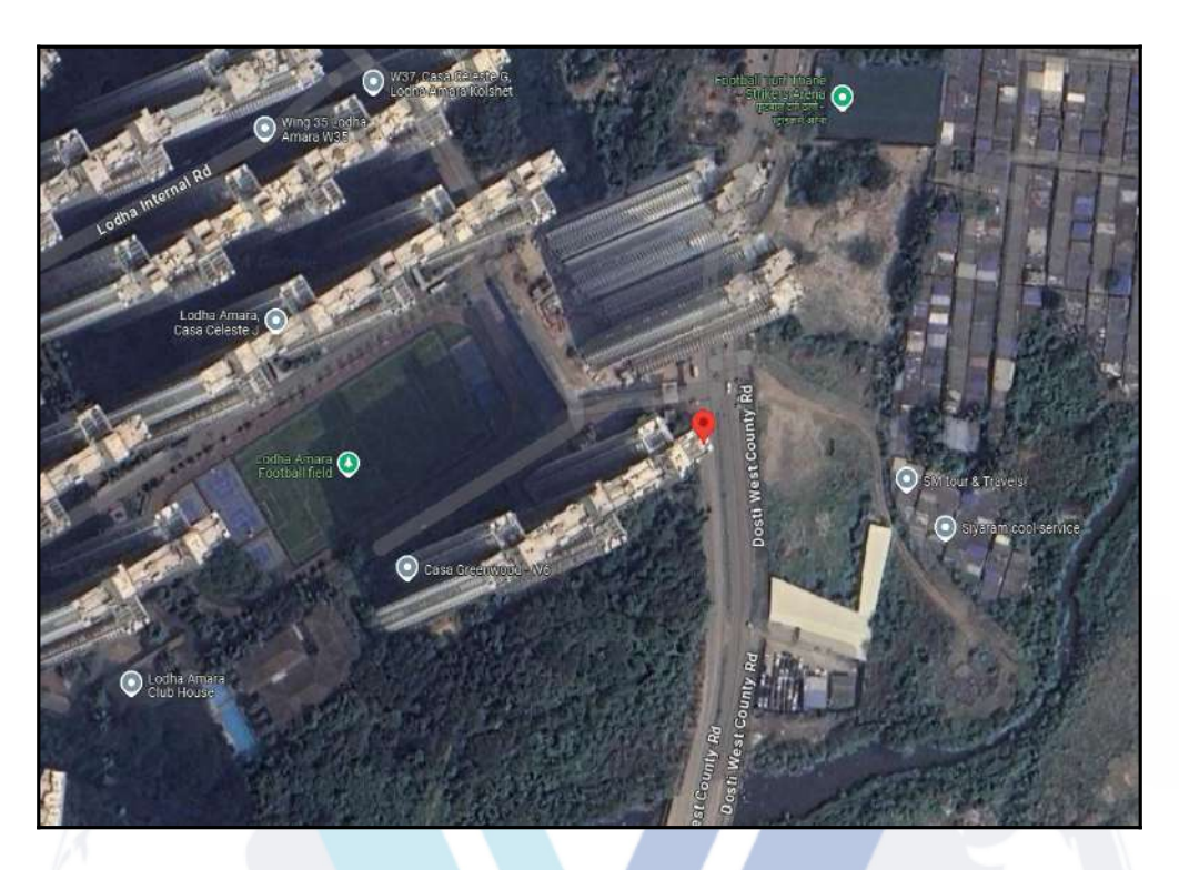
Note: Red Place mark shows the exact location of the property