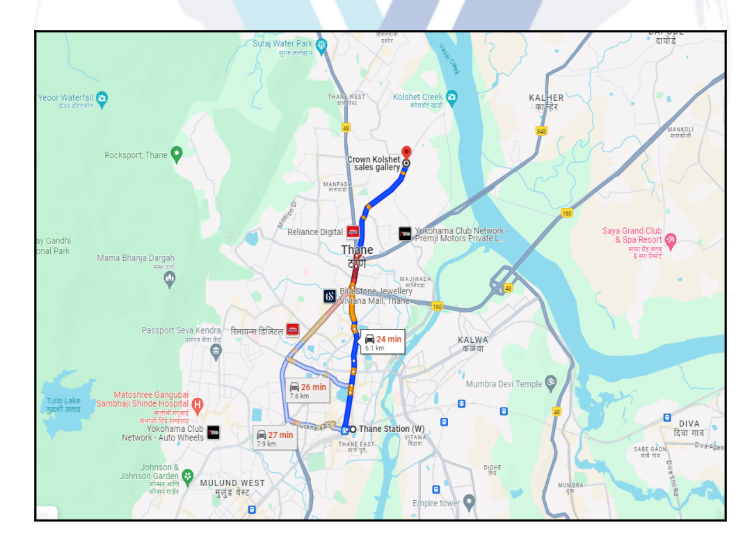
Longitude Latitude: 19°14'6.8"N 72°59'18.6"E

Note: The Blue line shows the route to site distance from nearest Railway Station (Thane - 6.1 Km).