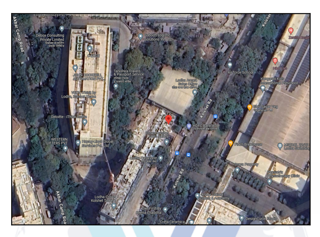
Note: Red marks shows the exact location of the property