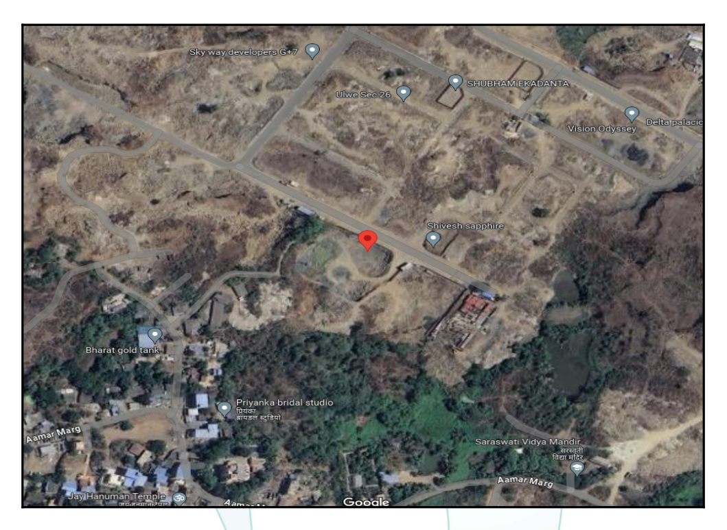
Note: Red marks shows the exact location of the property