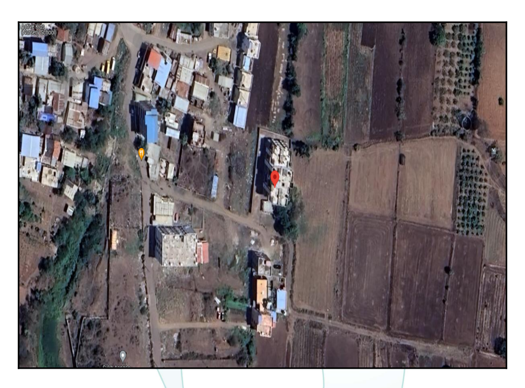
Note: Red marks shows the exact location of the property