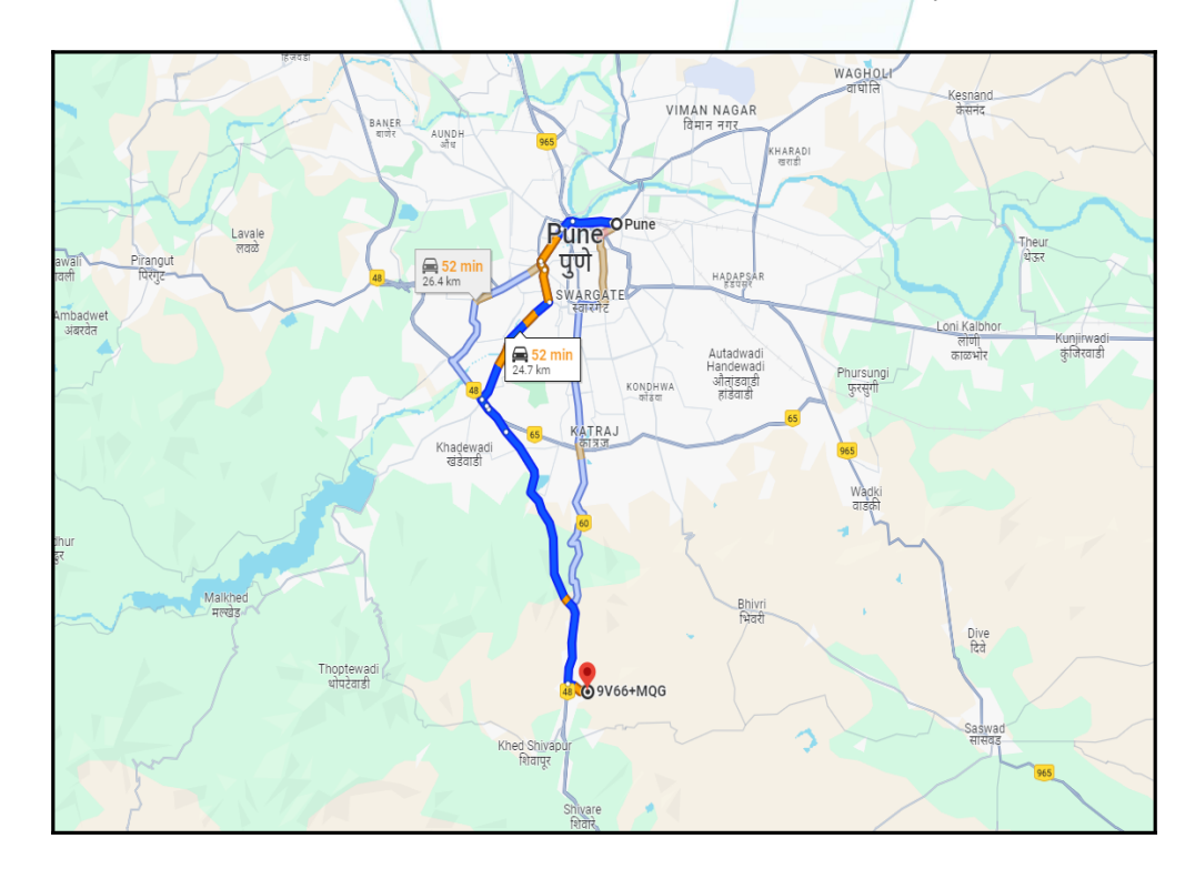
Longitude Latitude: 18°21'41.9"N 73°51'43.1"E

Note: The Blue line shows the route to site distance from nearest Railway Station (Pune - 24.7 Km.).