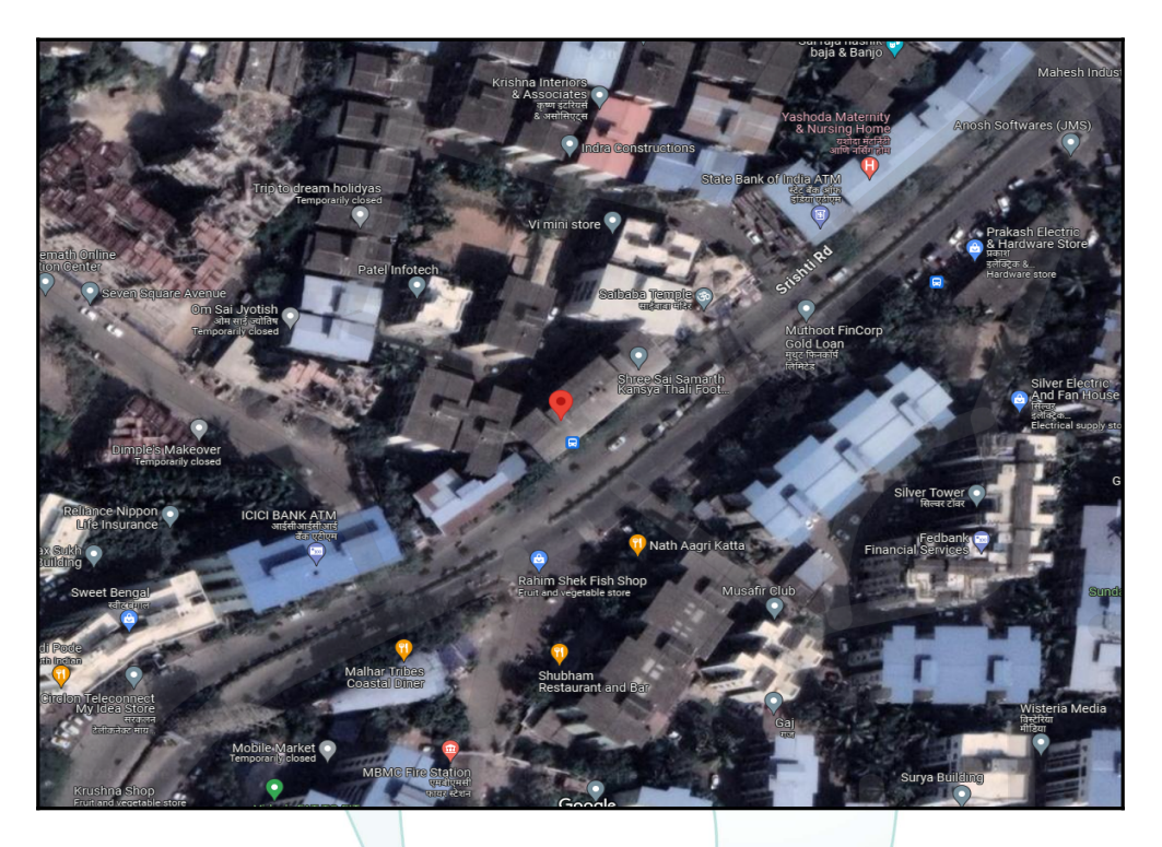
Note: Red marks shows the exact location of the property