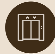
Automatic high speed branded elevators with glass view