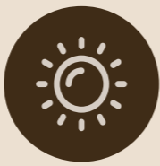
Ventilated apartments with Ample natural lights