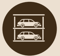
Automated car parking