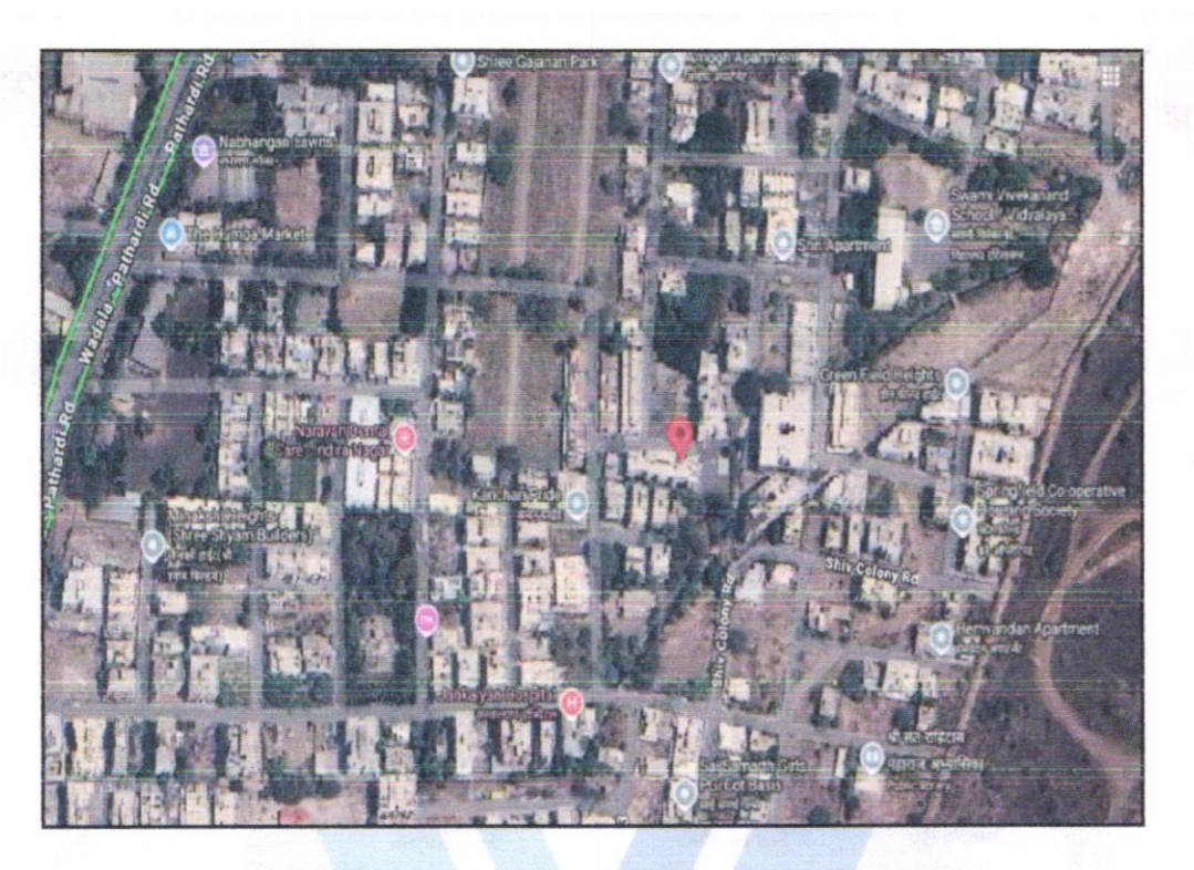
Note: Red Place mark shows the exact location of the property