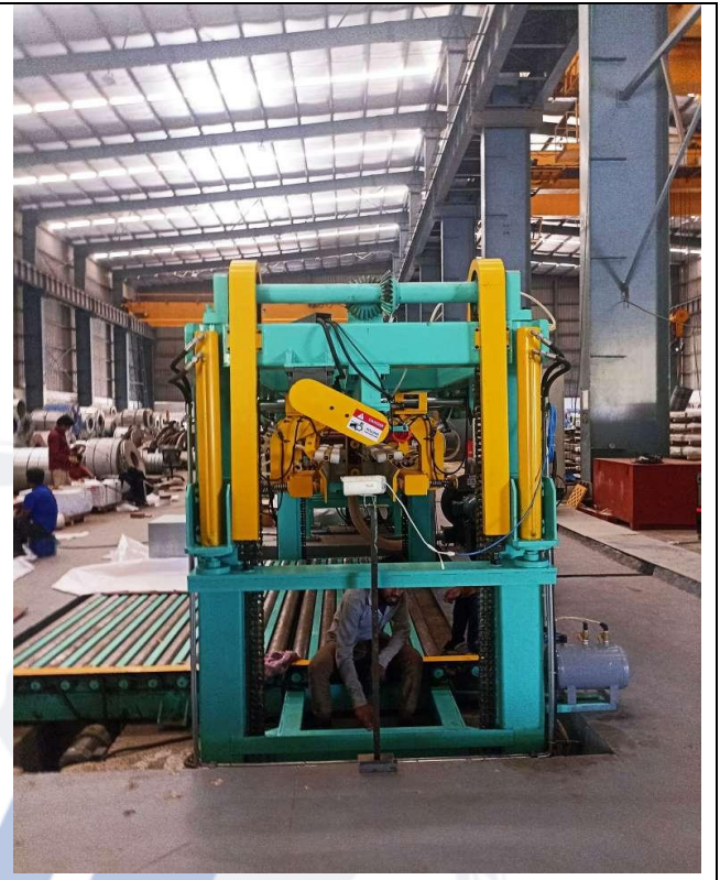
View of Rotary Shear Cut to Length Line, Sr. No. 24106, YOM-08.2024