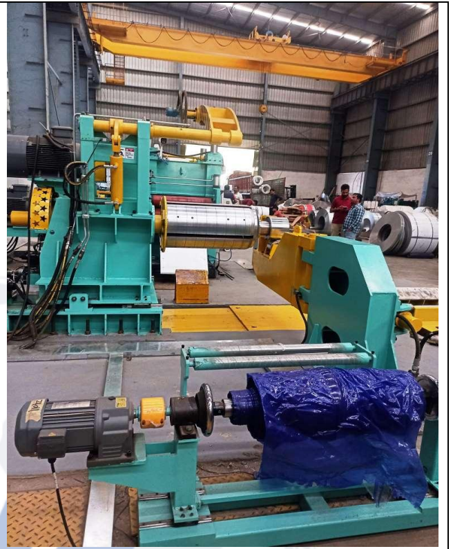
View of Rotary Shear Cut to Length Line, Sr. No. 24106, YOM-08.2024