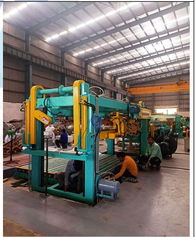
View of Rotary Shear Cut to Length Line, Sr. No. 24106, YOM-08.2024