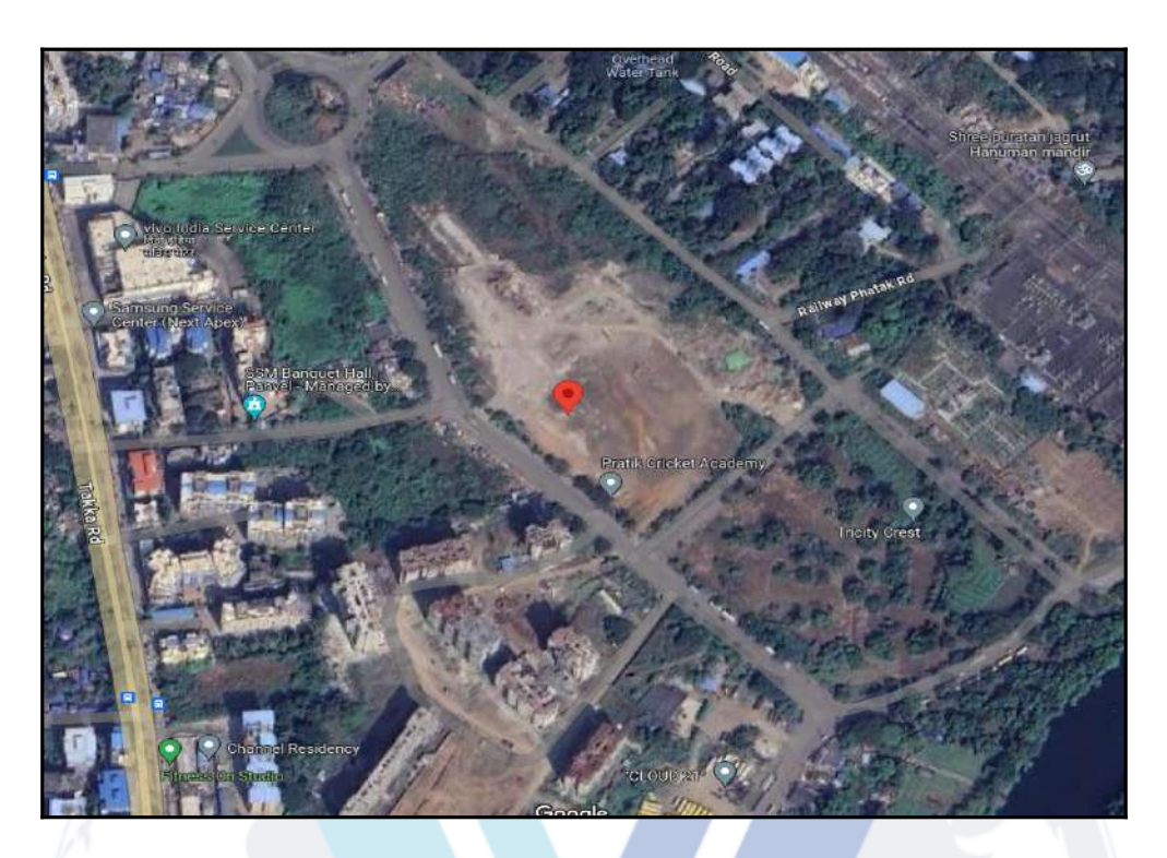
Note: Red marks shows the exact location of the property