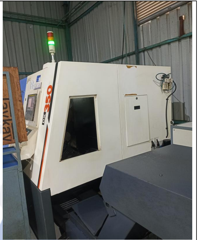
CNC Turing Centre with Fanuc Controller, Model- DX350-1000A, Sr. No. 60031034-2019