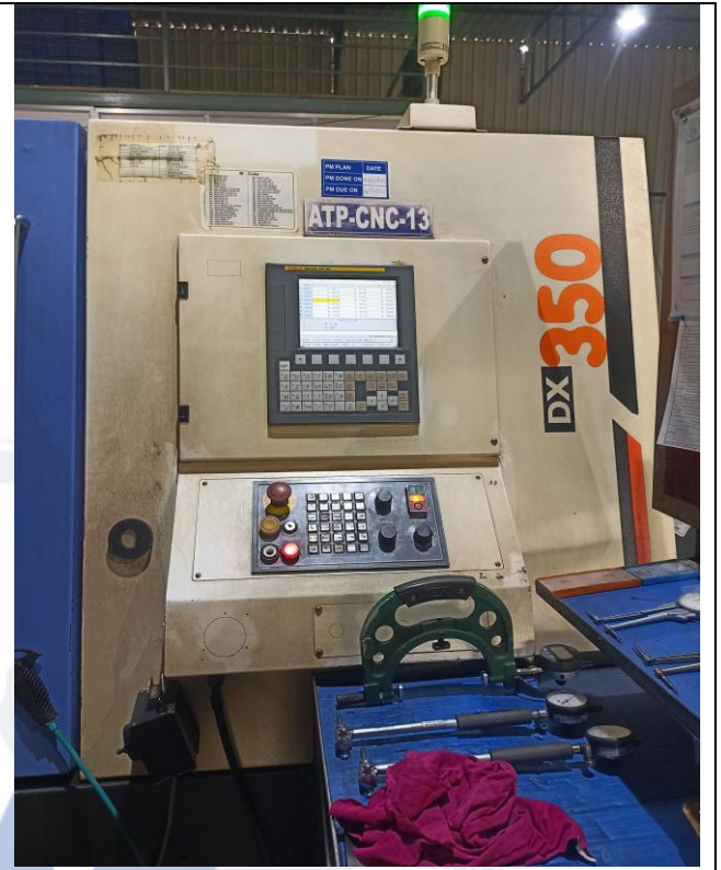
CNC Turret Centre with Fanuc Controller, Model- DX350-1000A, Sr. No. 60026593-2018