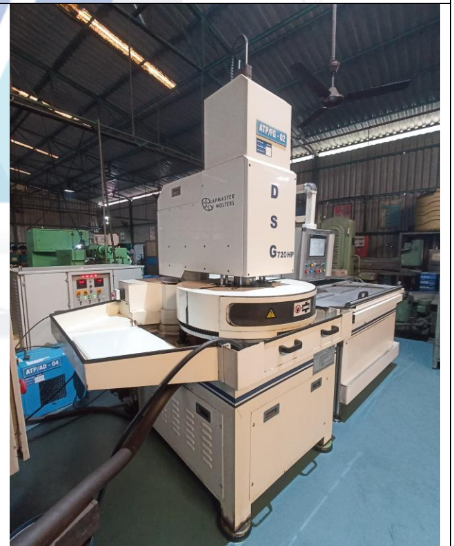
High Precision Dual Face Fine Grinding Machine, Model DSG 720HP