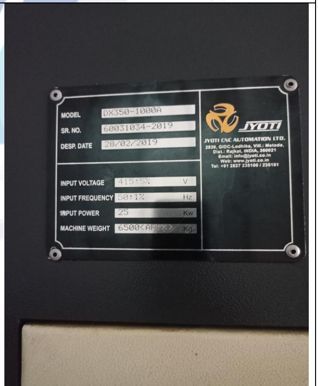
CNC Turing Centre with Fanuc Controller, Model- DX350-1000A, Sr. No. 60031034-2019