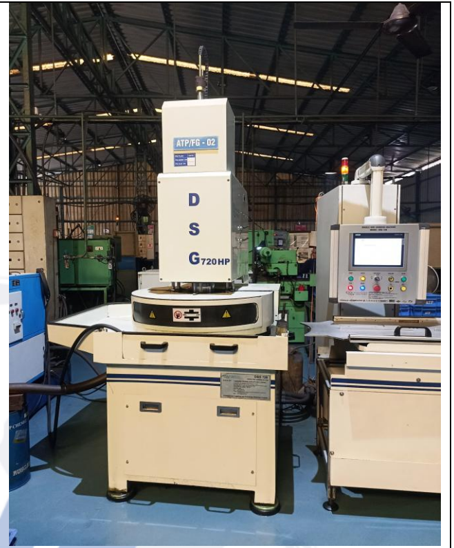
High Precision Dual Face Fine Grinding Machine, Model DSG 720HP