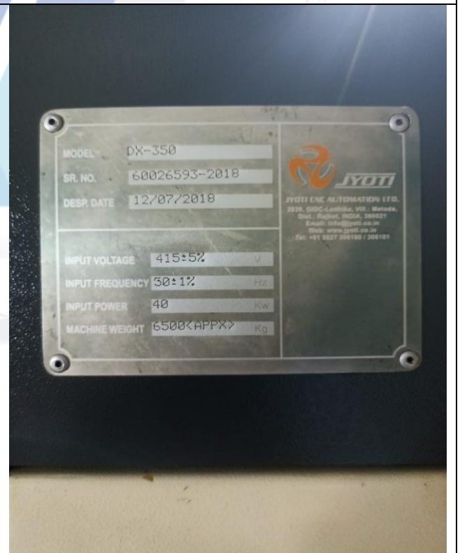
CNC Turret Centre with Fanuc Controller, Model- DX350-1000A, Sr. No. 60026593-2018