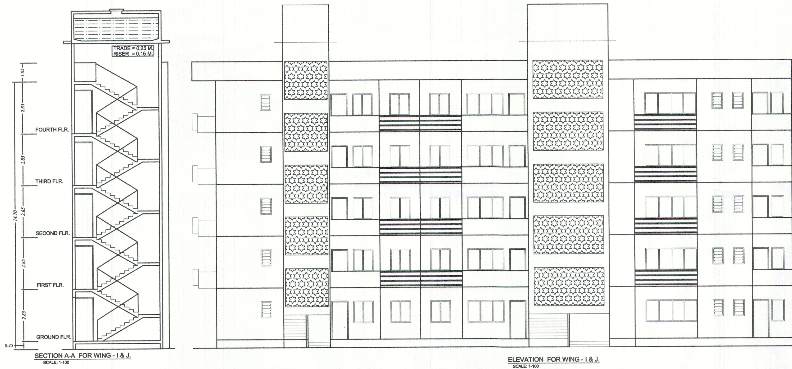
SITE UNDER REF.