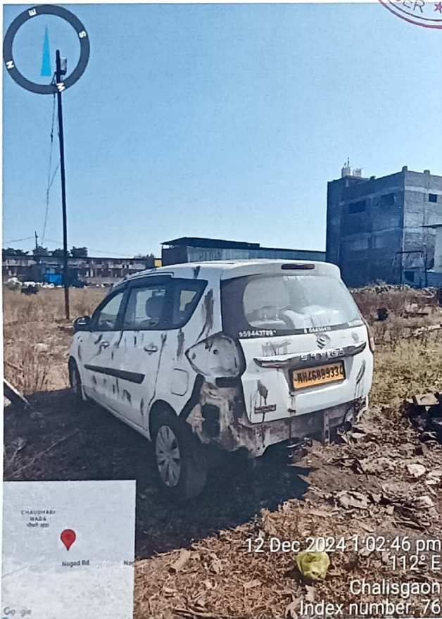
12 Dec 2024 1:02:46 pm 112° E Chalisgaon Index number: 76

SUDHIR CHAUDHARI INSURANCE VALUER SLA-123040 H/F-4531