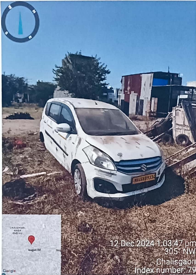
12 Dec 2024 1:03:47 pm 305° NW Chalisgaon Index number: 79