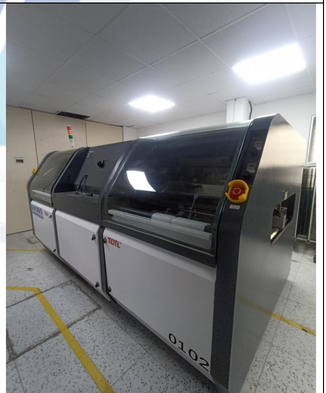
Selective soldering, Model-YDYL0102 (Input supply voltage range 415-44-VAC)