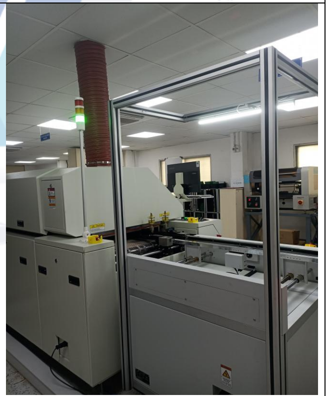
Reflow oven with tools and accessories for Reflow Oven-HB, Model- HB-CR-1002-N