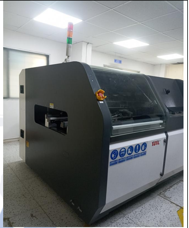
Selective soldering, Model-YDYL0102 (Input supply voltage range 415-44-VAC)