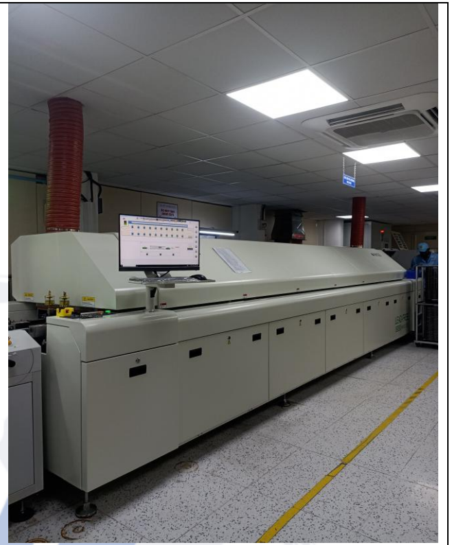
Reflow oven with tools and accessories for Reflow Oven-HB, Model- HB-CR-1002-N