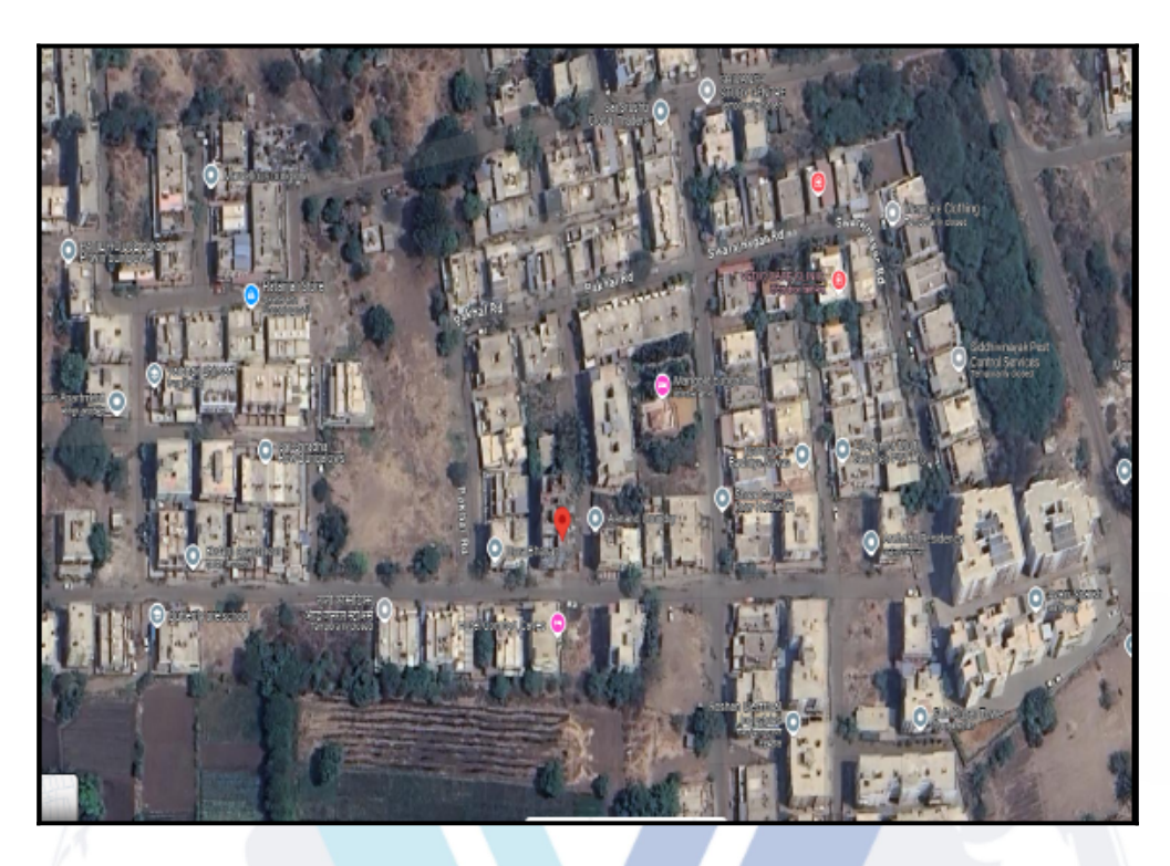
Note: Red Place mark shows the exact location of the property