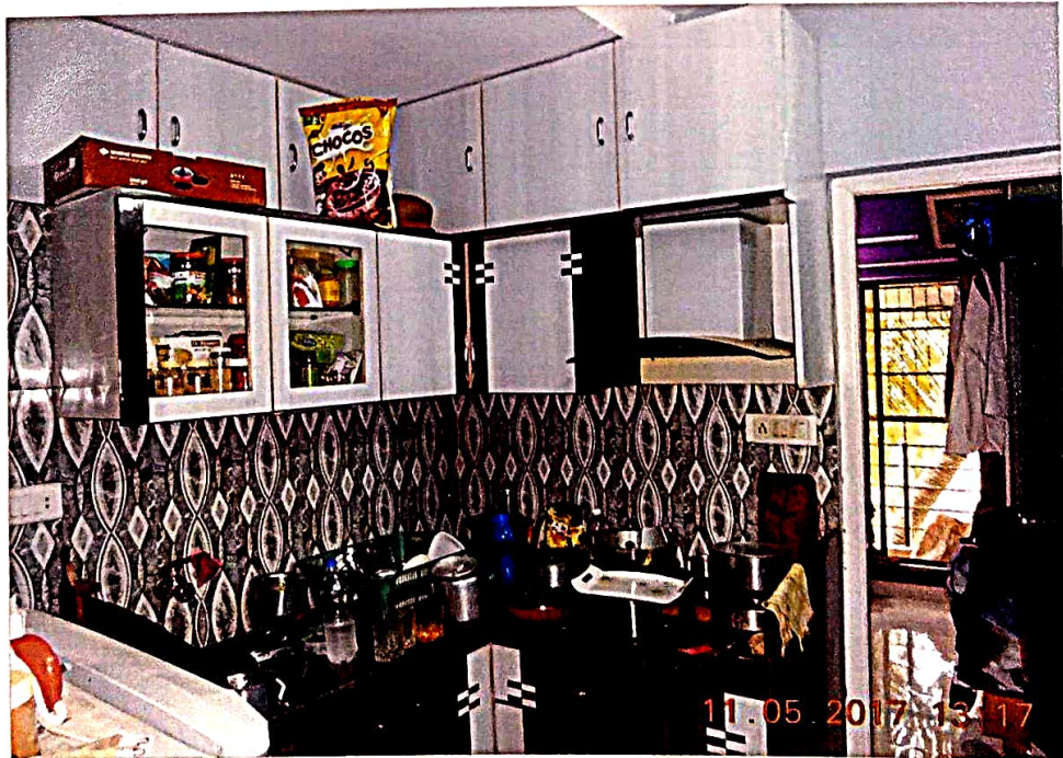
K I T C H E N