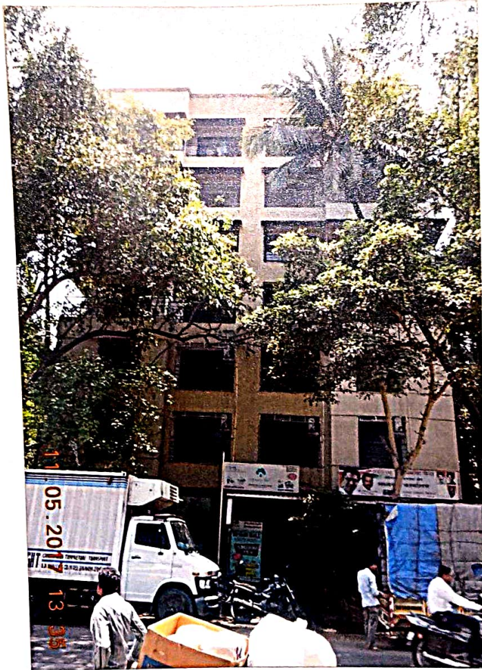
VIEW OF BUILDING

FLAT NO. 401 , 4 TH FLOOR , "JATIN PROBHA" , L.T. ROAD NO. 5 , C.T.S. NO. 199 , VILLAGE - PAHADI , GOREGAON - WEST , MUMBAI - 400 062 .