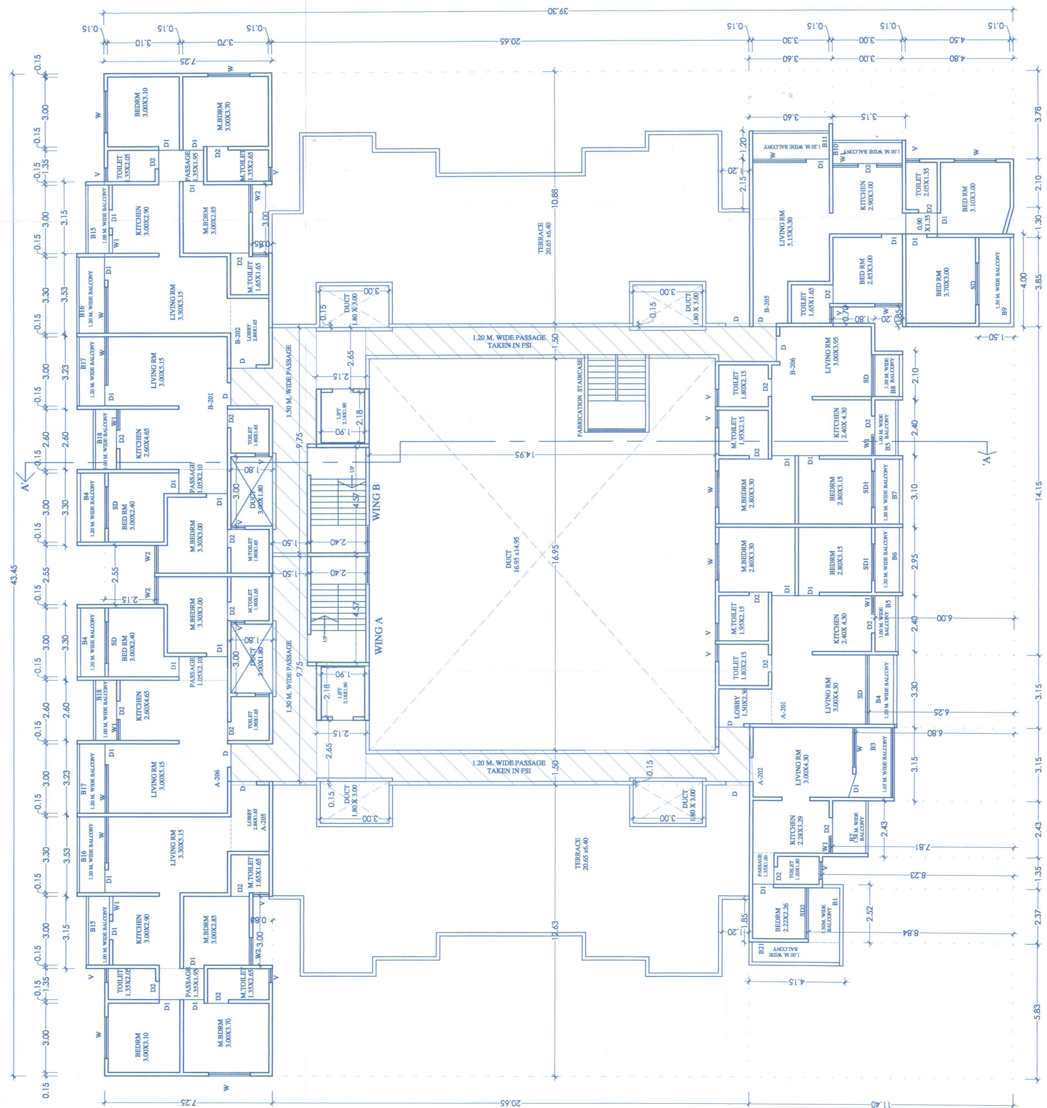
WING A & B 2nd FLOOR PLAN. SCALE: 1:100