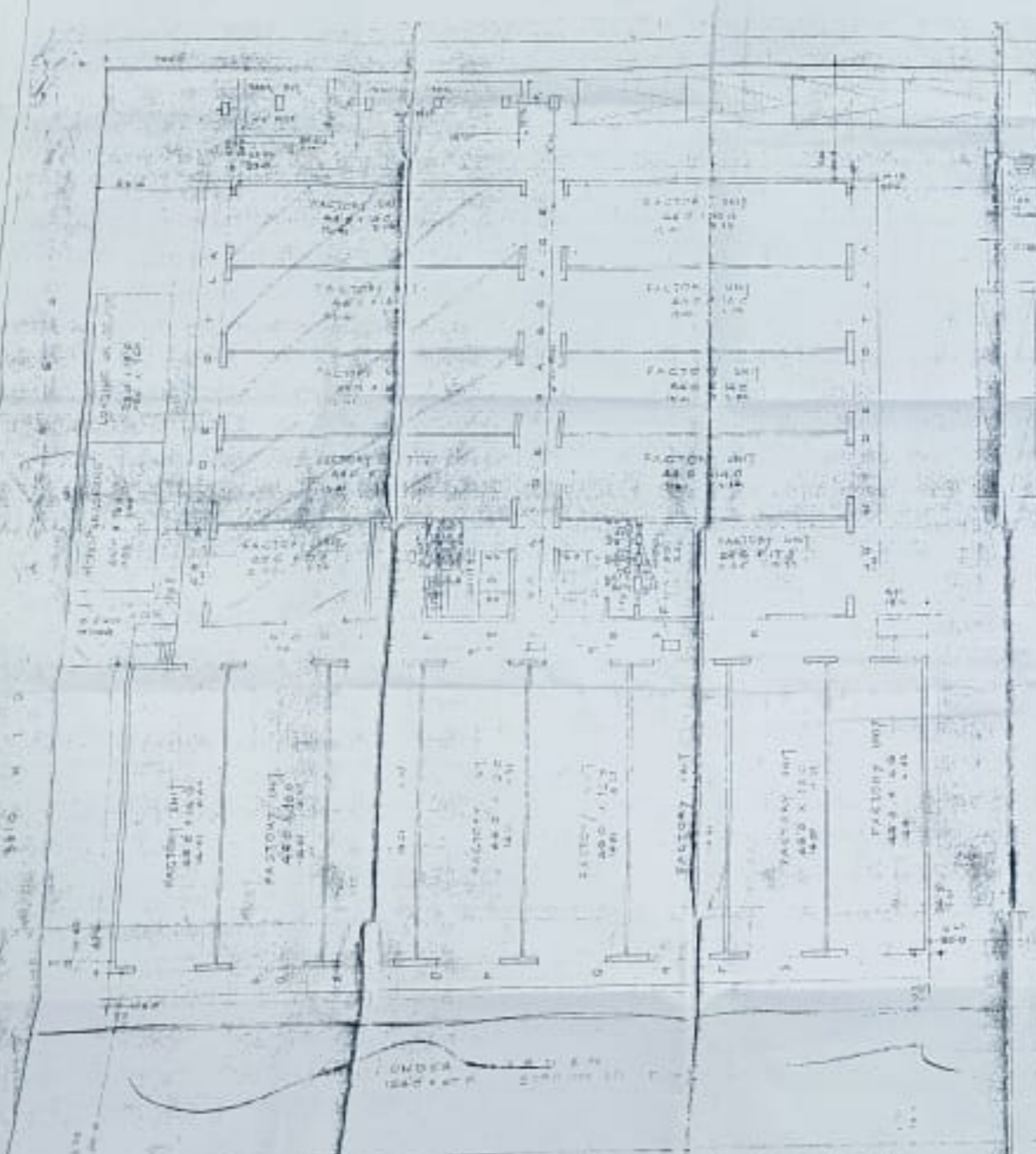
PLAN OF SECOND FLOOR