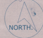
LOCATION PLAN SCALE - N.T.S.