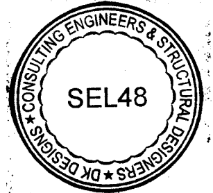
TABLE - C

List of Extra / Additional / Deleted Items considered in the Cost (Which were not parts of the original Estimate of Total Cost)