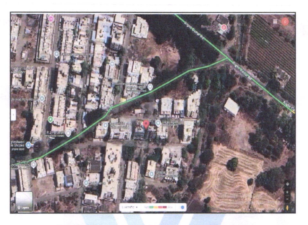
Note: Red Place mark shows the exact location of the property