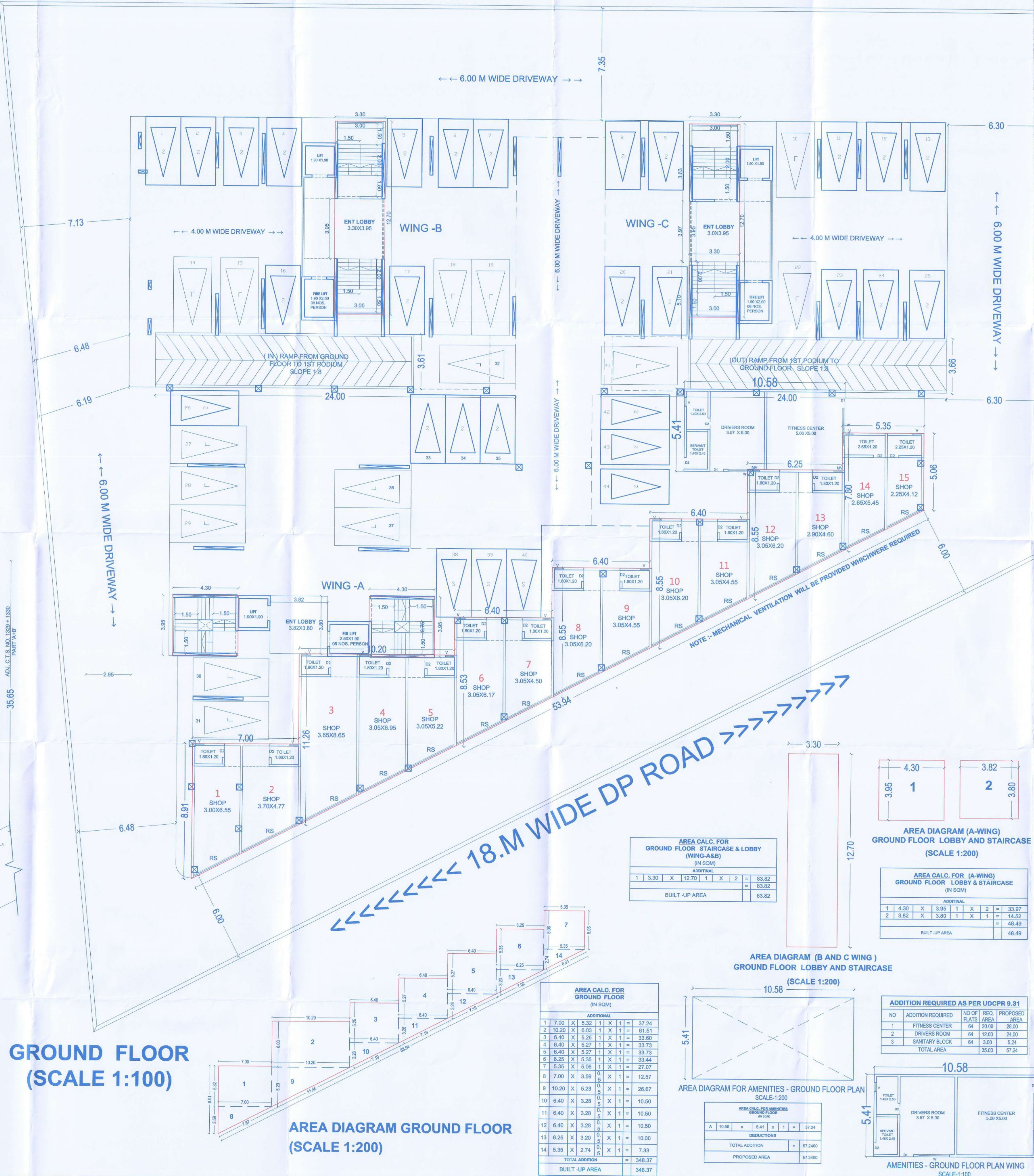
AREA DIAGRAM GROUND FLOOR (SCALE 1:200)