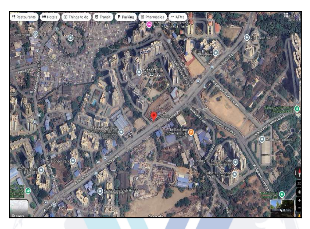
Note: Red marks shows the exact location of the property