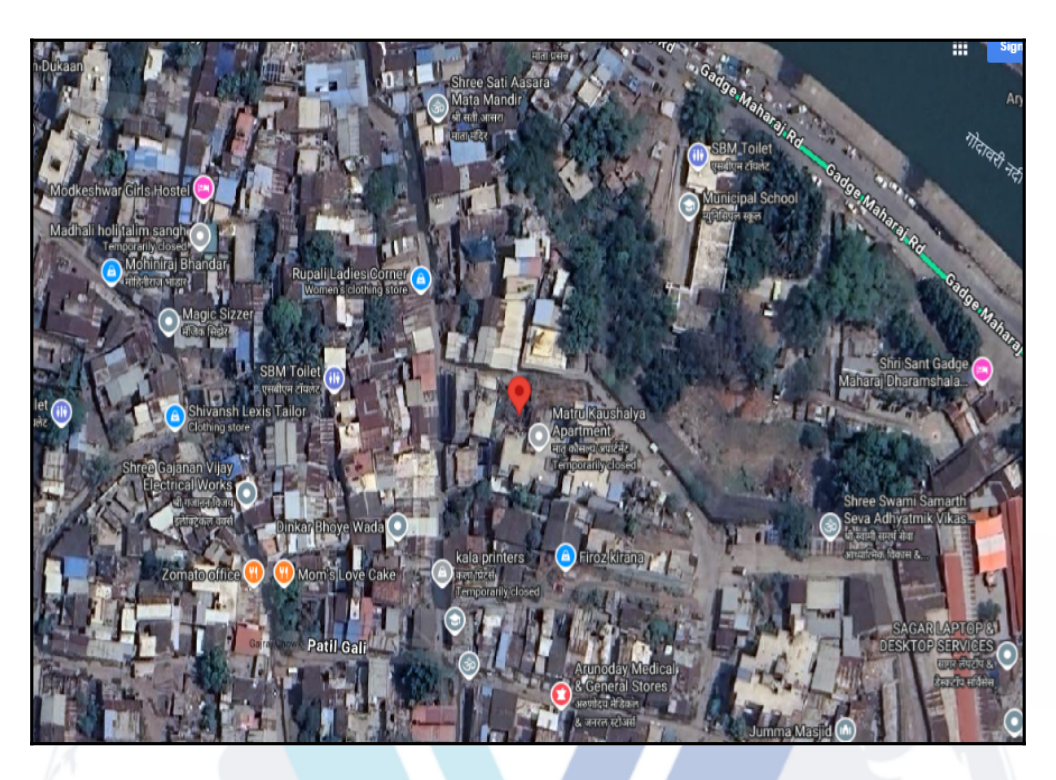
Note: Red marks shows the exact location of the property