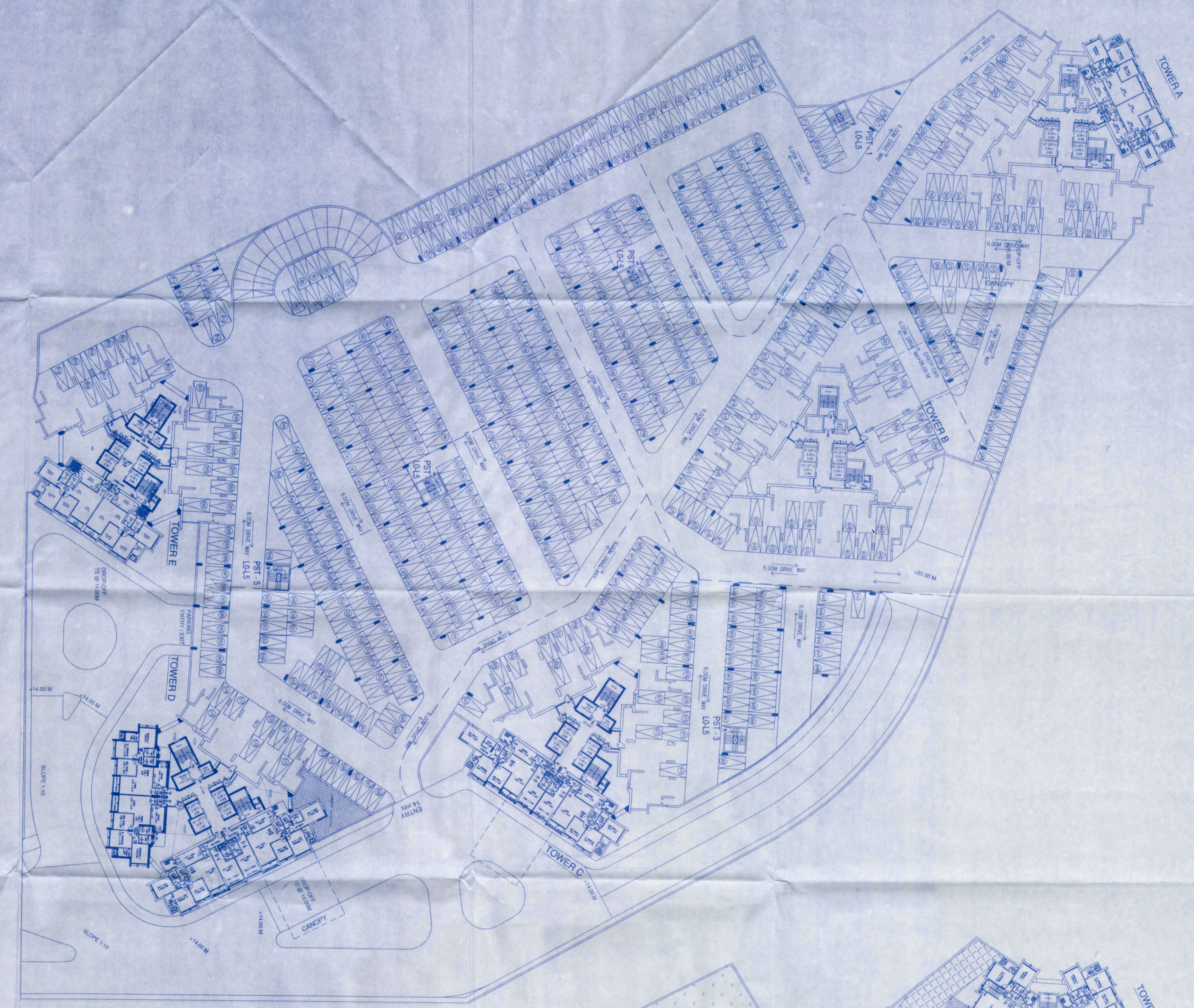
5TH FLOOR PLAN SCALE - 1:300