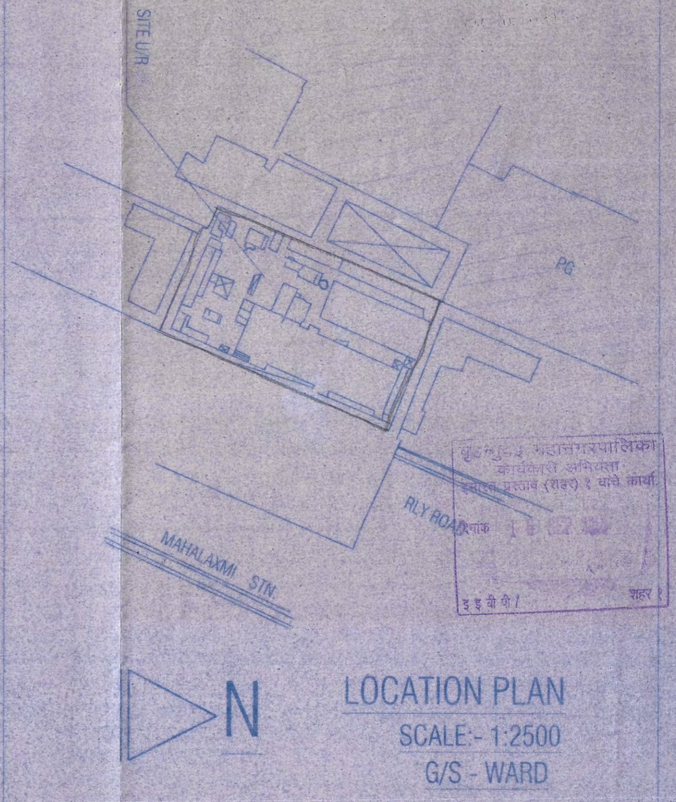
LOCATION PLAN SCALE - 1:2500 G/S - WARD

Approved Subject to Condition Mentioned in the file No. EEBP CHE/city/1059/63/342 dt. 16/09/15