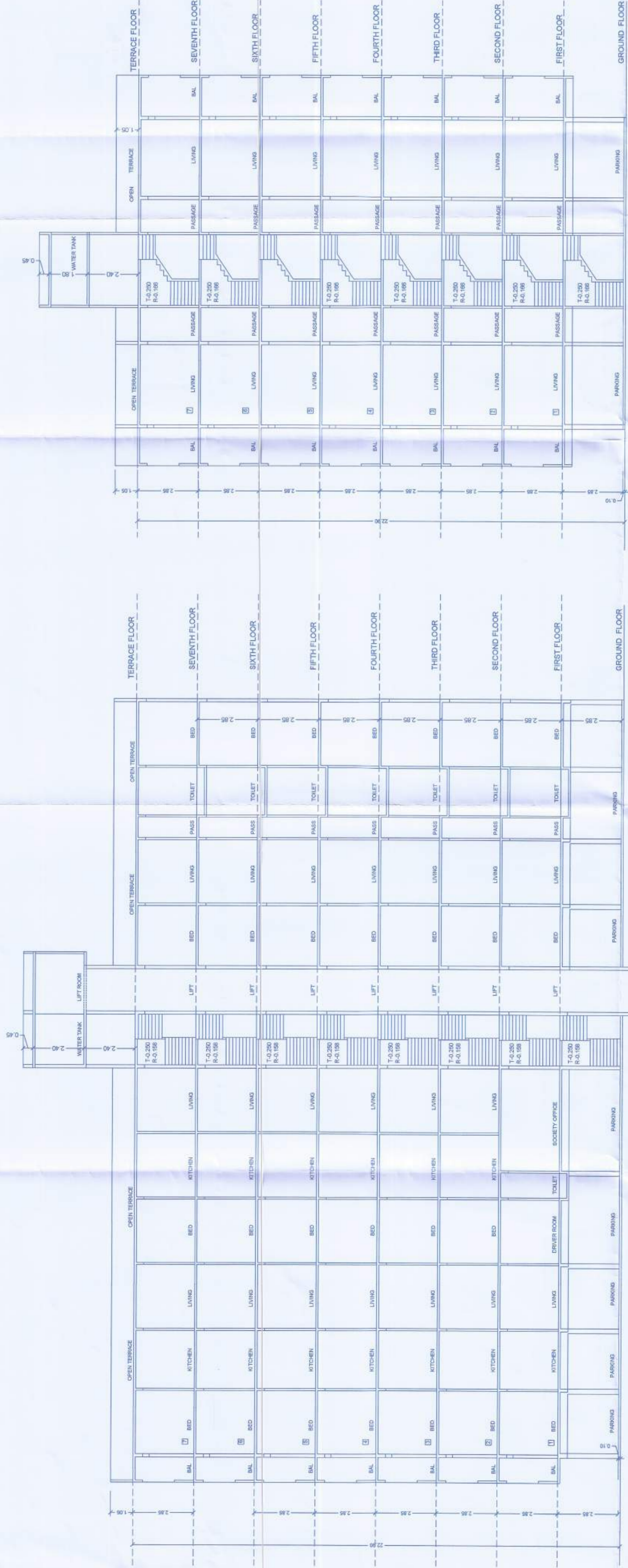
SECTION 'B' TYPE SCALE: 1:100