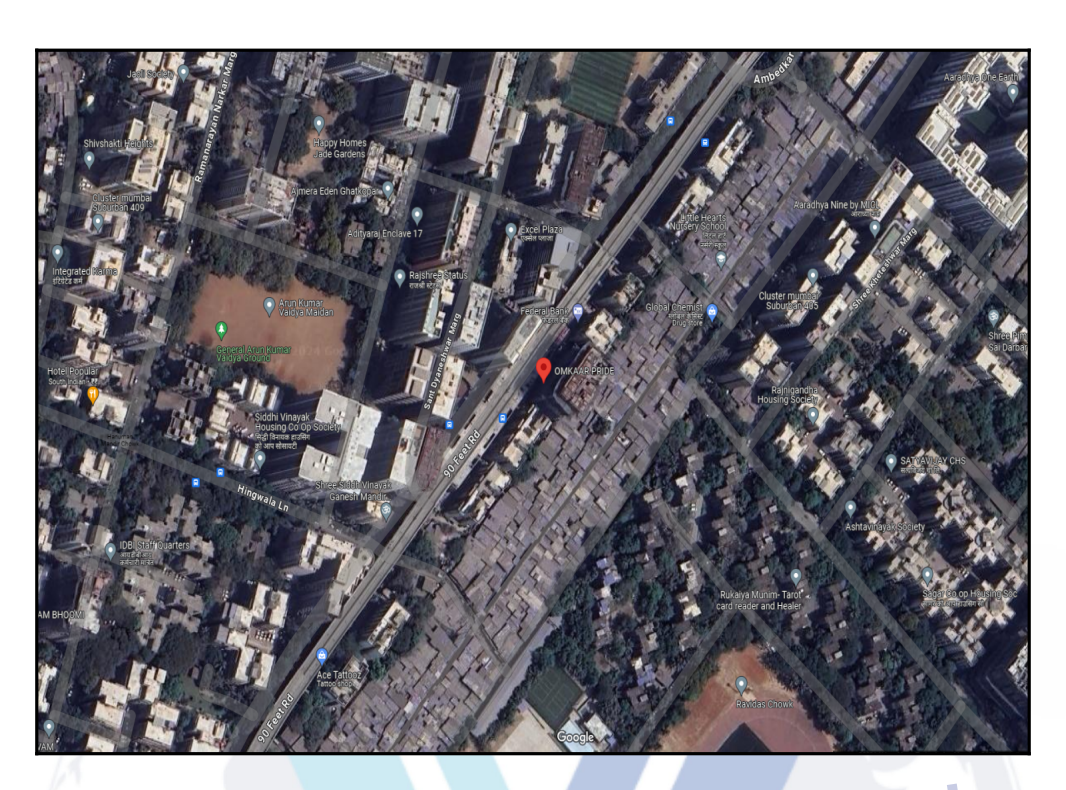
Note: Red marks shows the exact location of the property