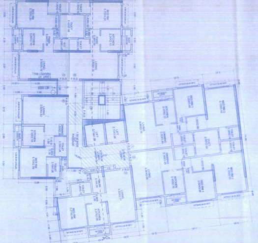
3RD FLOOR PLAN (COMPOSITE BLOCK NO. 2) SHEET NO. 8-11 SCALE: 1/8" = 1'-0"