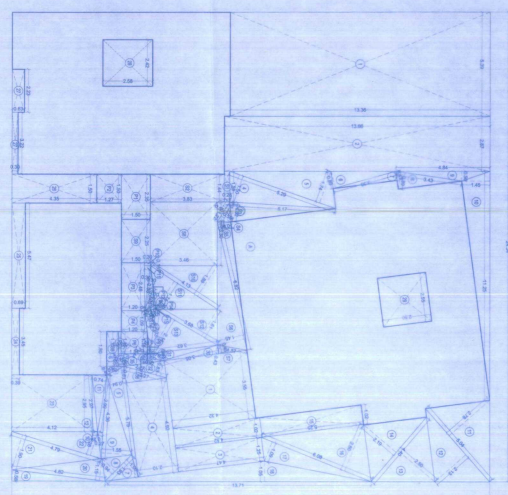
2ND FLOOR PLAN (COMPOSITE BLOCK NO. 2) SHEET NO. 8-11 SCALE: 1/8" = 1'-0"