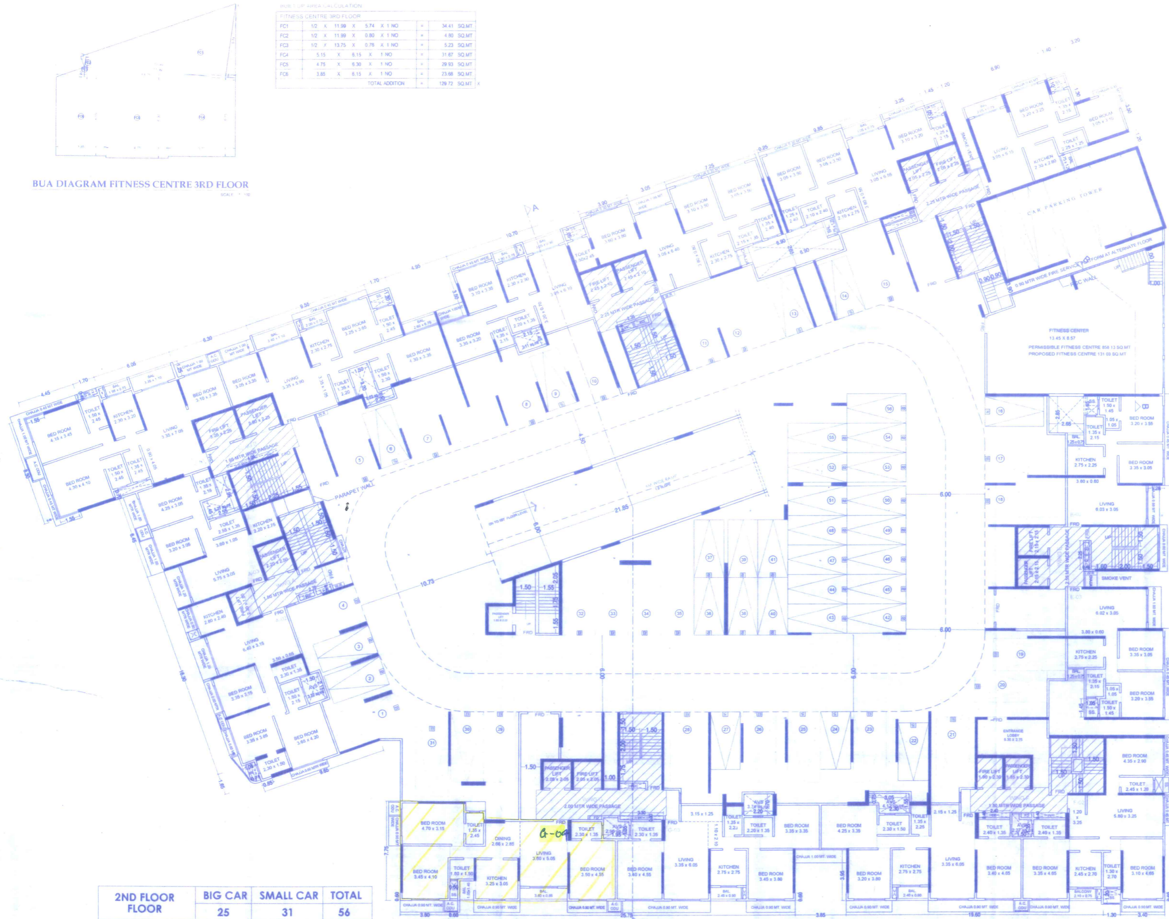
BUA DIAGRAM FITNESS CENTRE 3RD FLOOR