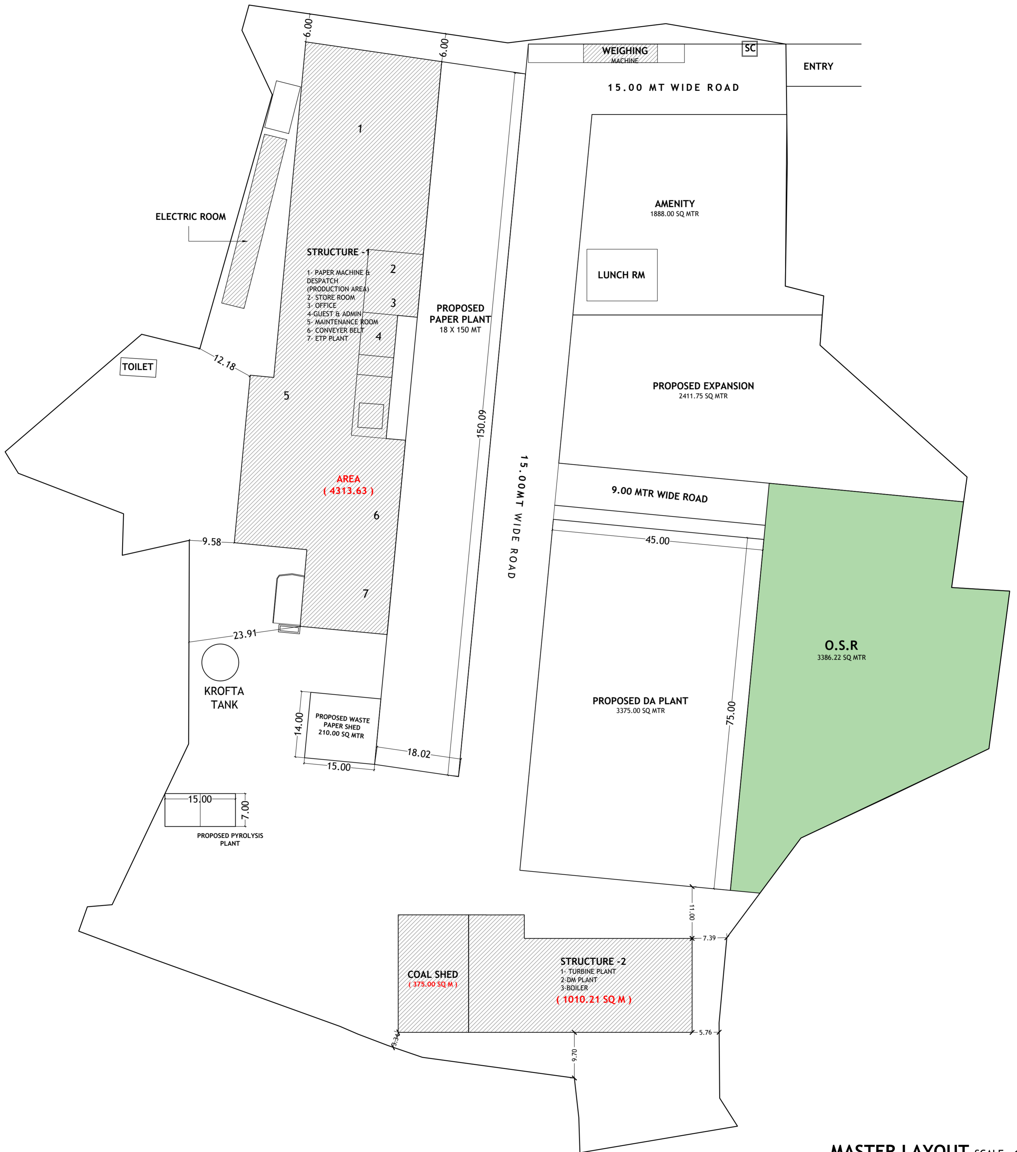
MASTER LAYOUT SCALE - 1:500