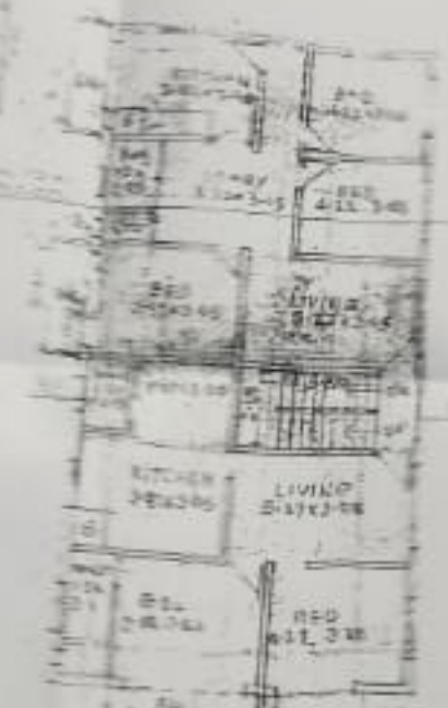
3rd FL PLAN PROPOSED