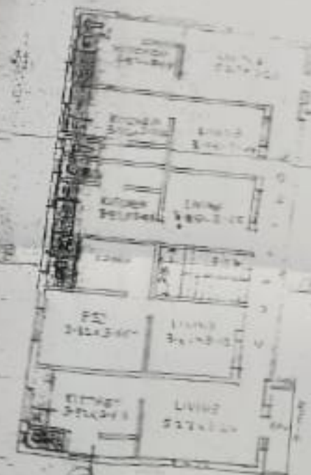
2nd FL PLAN EXISTING