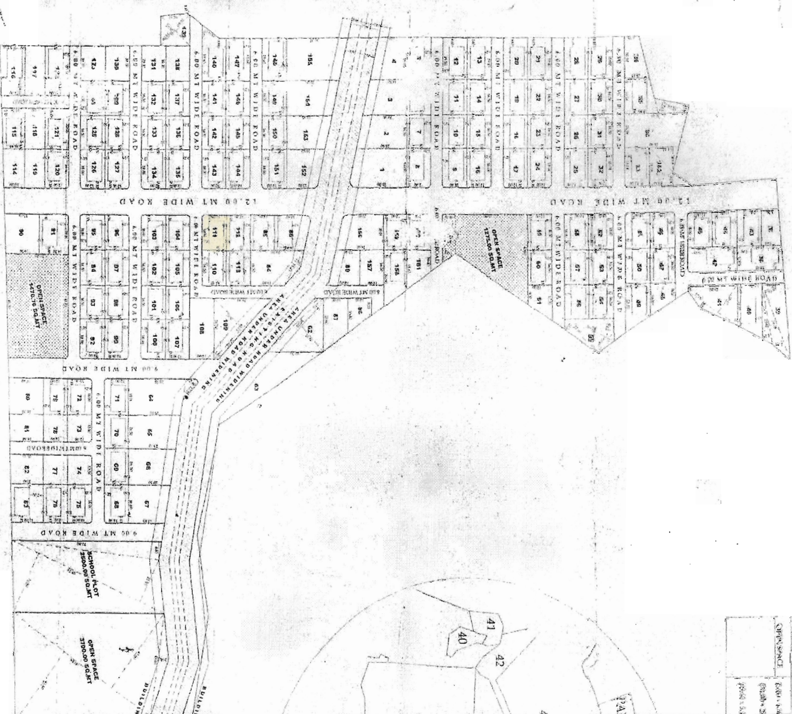
LAYOUT PLAN SCALE: 1:500