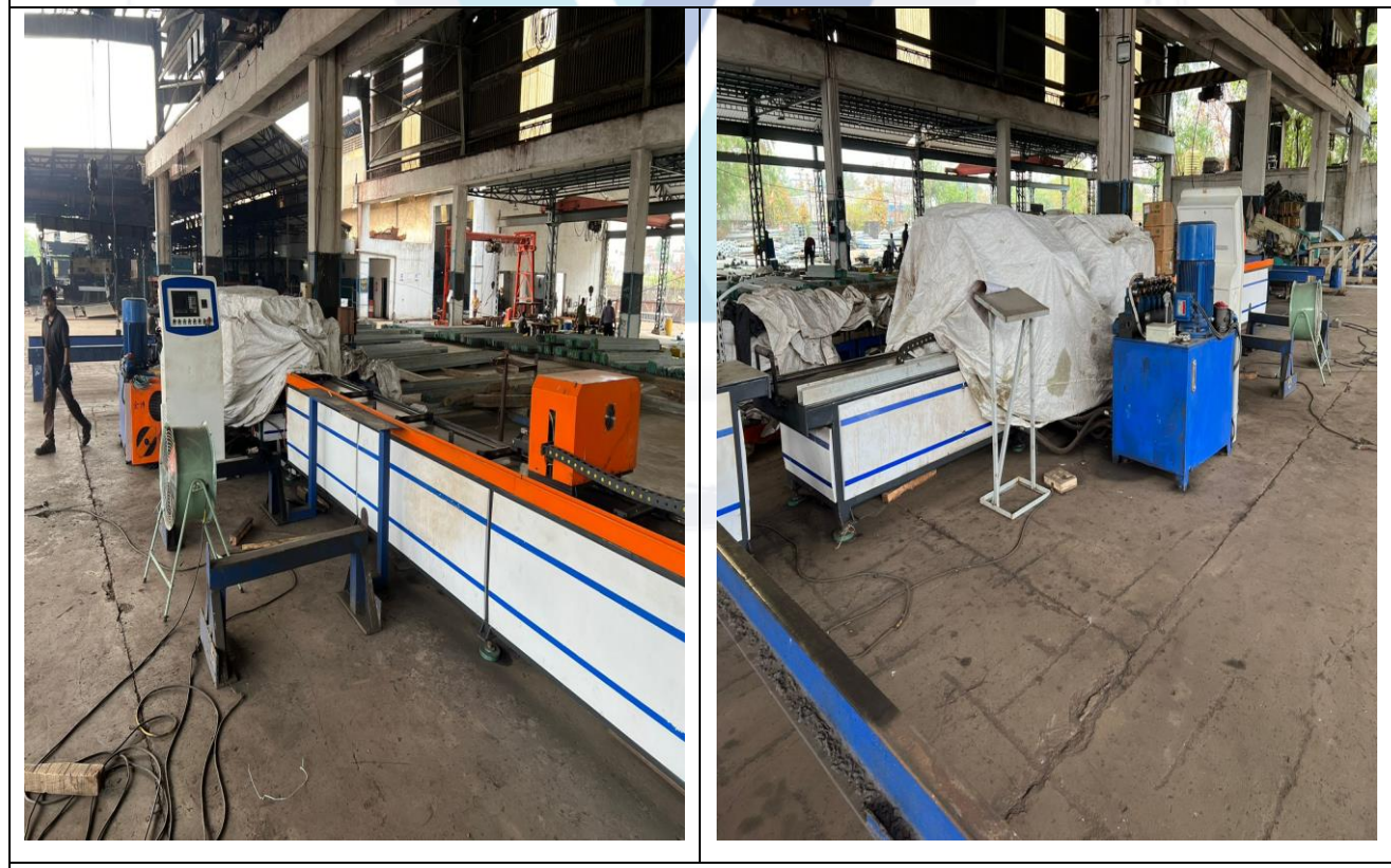
6 Station CNC Punching Machine, Model-JB-ZYCJ613 with accessories