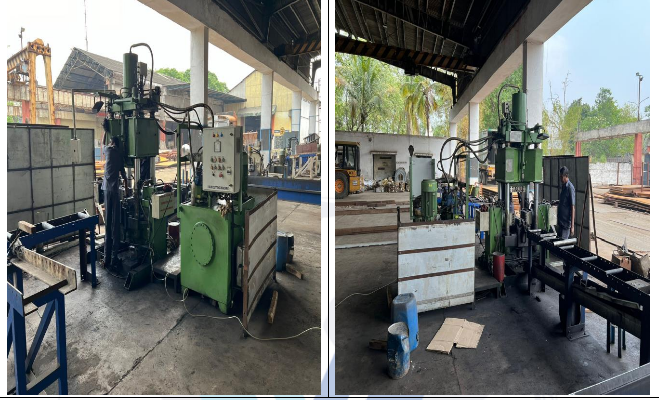
Hydraulic I-Beam Cutting Machine, Capacity-150 Ton, Sr. No. IB-150/2023-24