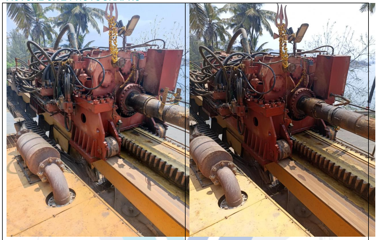
HDD Machine DL4500