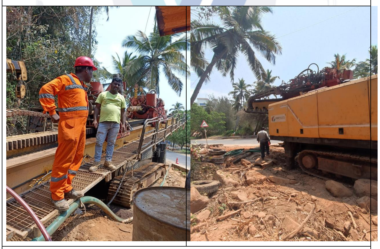
HDD Machine DL4500