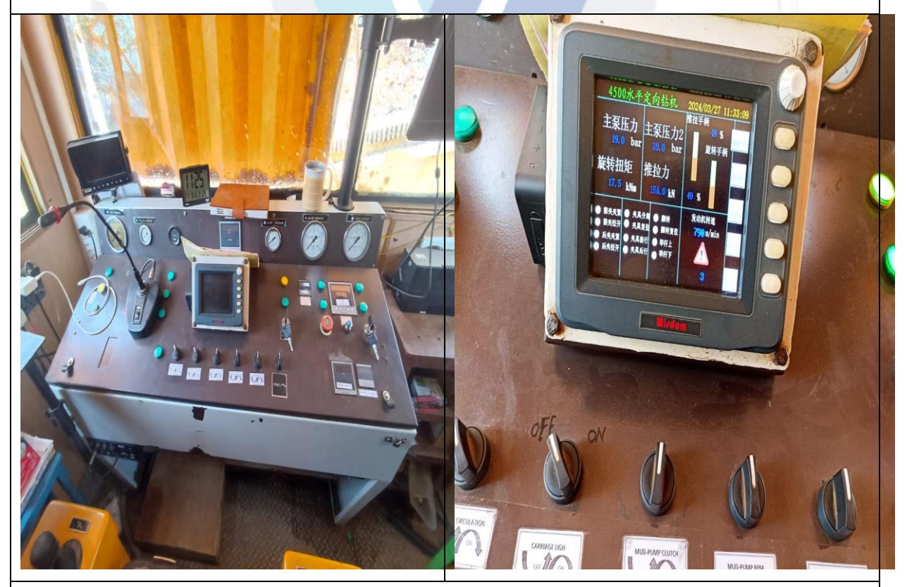
HDD Machine DL4500