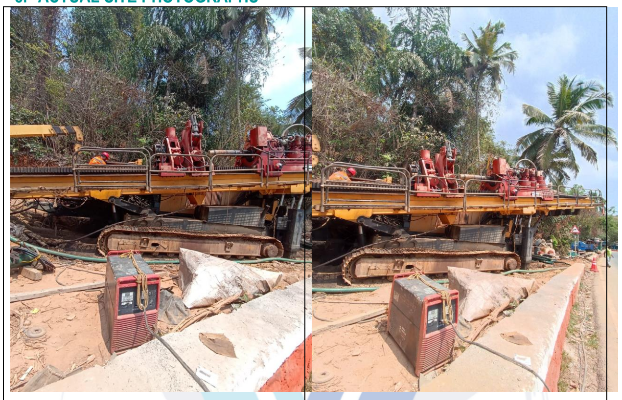
HDD Machine DL4500