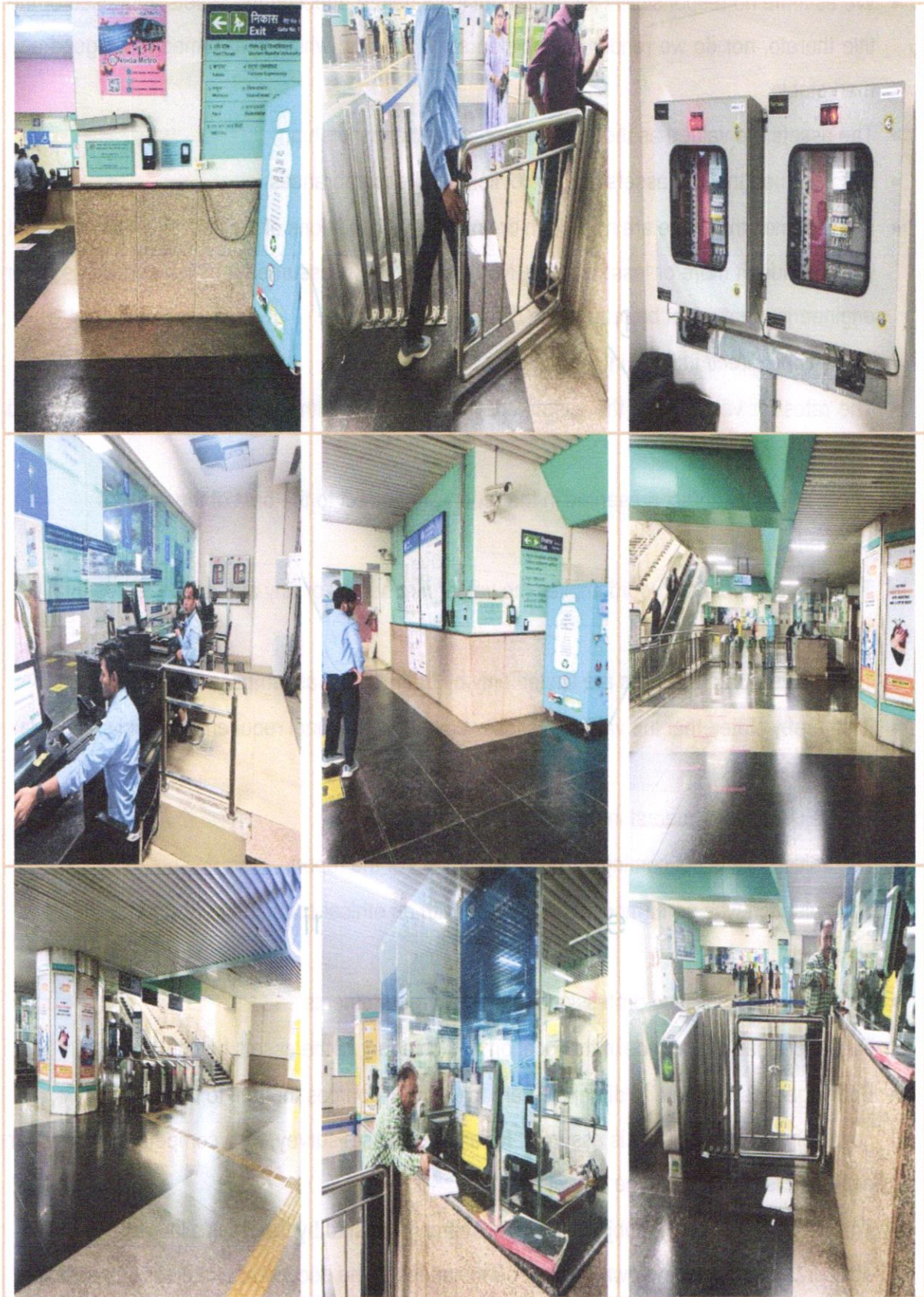
Station Interior, Andheri Metro Station