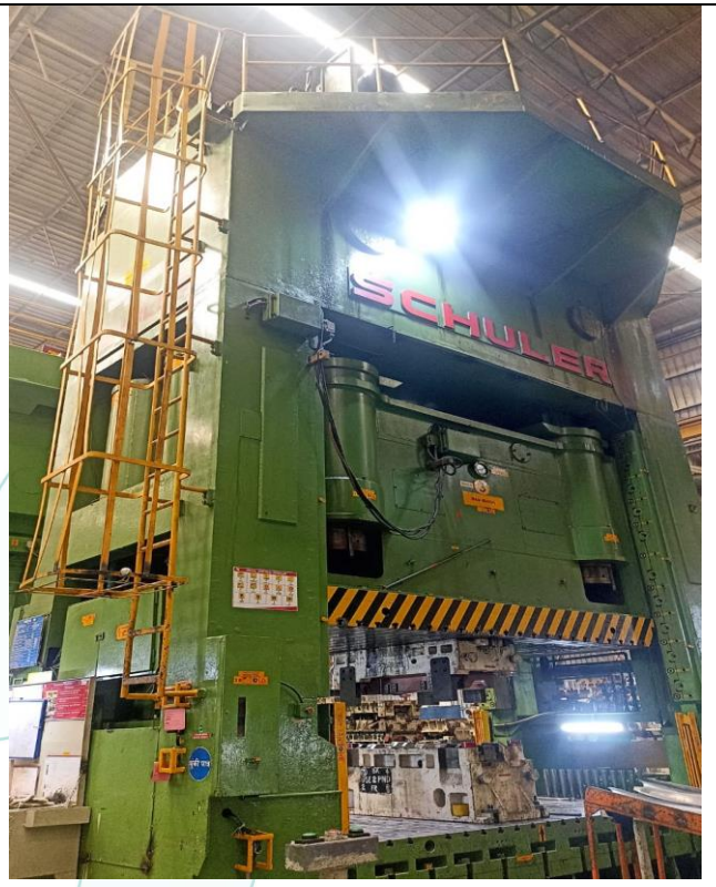
Used Mechanical Press along with the DMG Feeder, Manufacturer-Schuler, Type-P4E2 SQ 1200/3,5/0.6