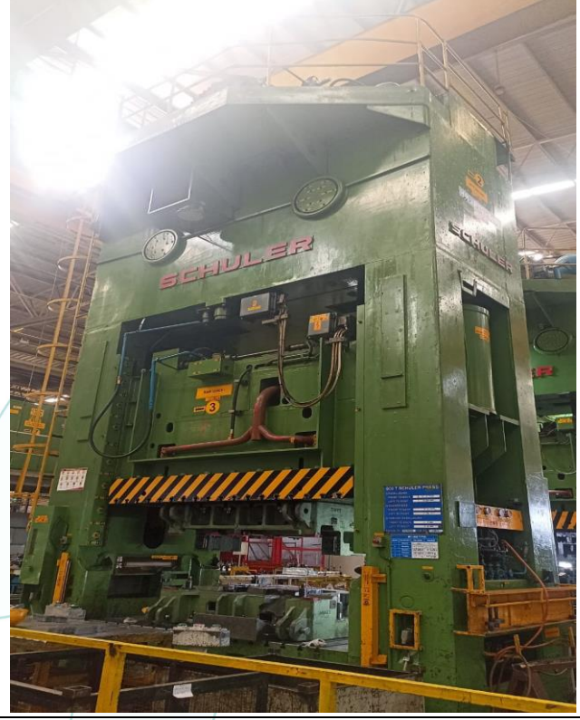
Used Mechanical Drawing Press, Manufacturer-Schuler, Type-P2E2 SQ 800/2,8/0,6