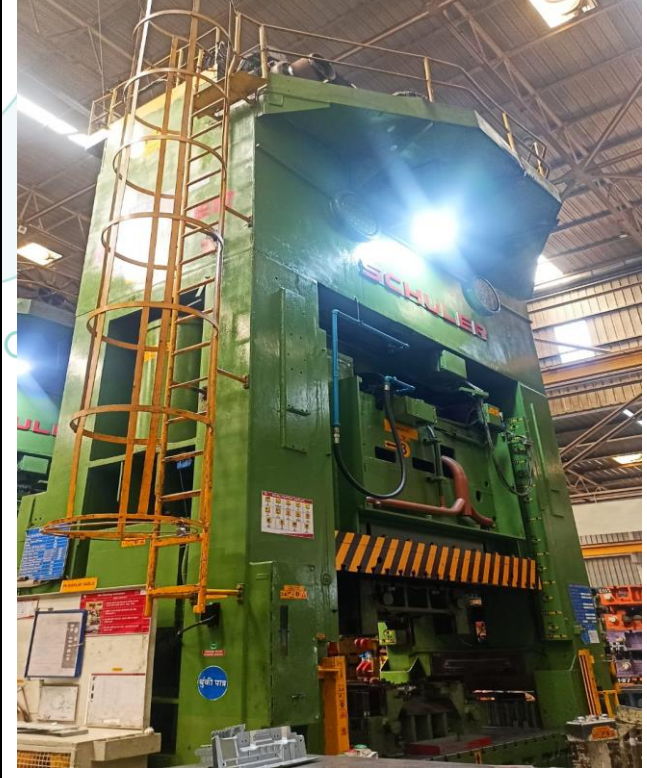
Used Mechanical Drawing Press, Manufacturer-Schuler, Type-P2E2 SQ 800/2,8/0,6