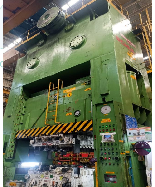
Used Mechanical Drawing Press, Manufacturer-Schuler, Type-P2E2 SQ 800/2,8/0,6