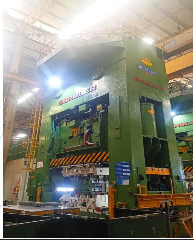
Used Mechanical Drawing Press, Manufacturer-Schuler, Type-P2E2 SQ 800/2,8/0,6