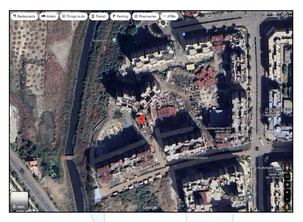
Note: Red marks shows the exact location of the property