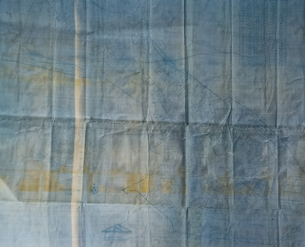
LOCATION PLAN 1:500

SECRET NO FORN DISSEM NO UNCLASSIFIED NO UNCLASSIFIED