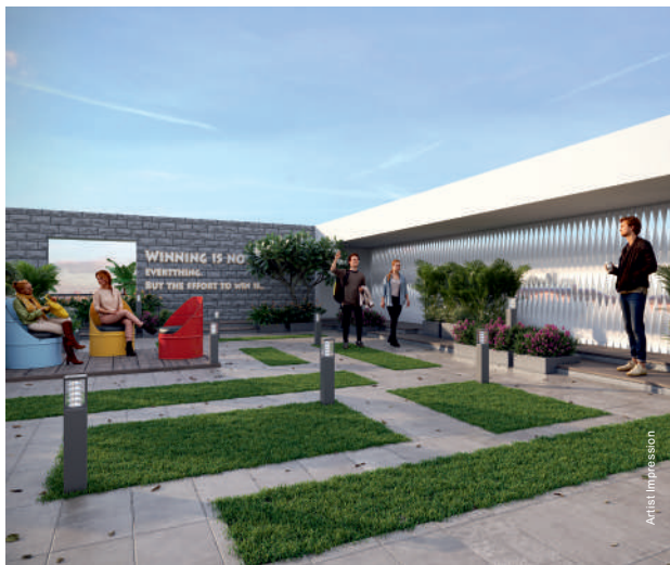
ROOFTOP SIT OUTS