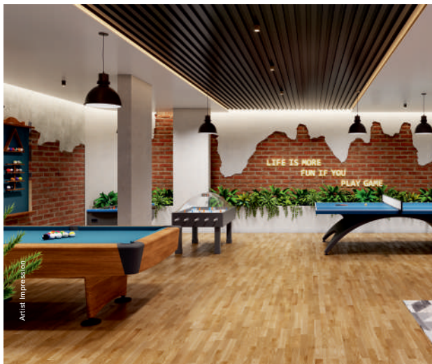
INDOOR PLAY AREA