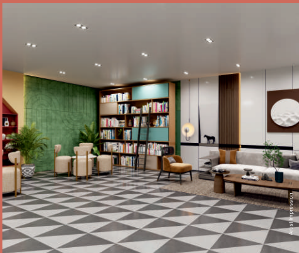
LIBRARY & MULTIPURPOSE HALL