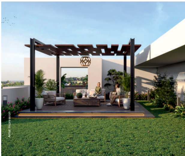
PERGOLA SITTING AREA