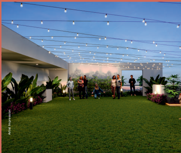
LANDSCAPED TERRACE GARDEN