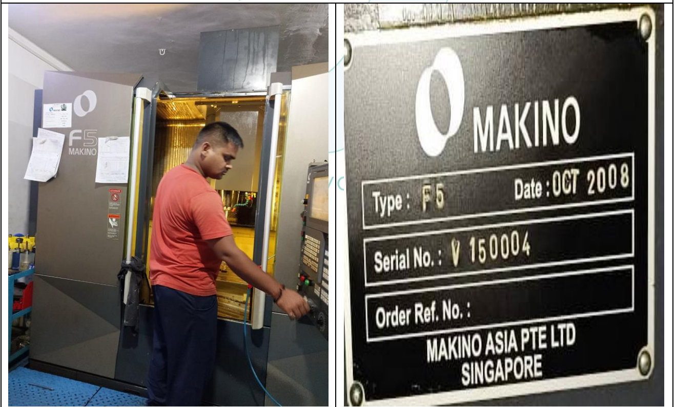
Vertical machining Centre, Model F5, Sr. No. V150004