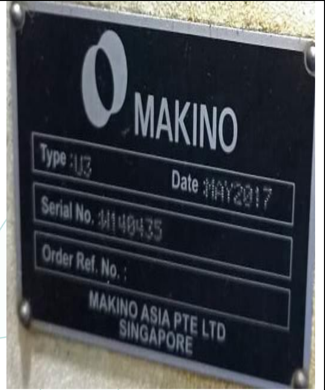
Makino make CNC Wire Cut EDM - U3, Sr. No.-W140435