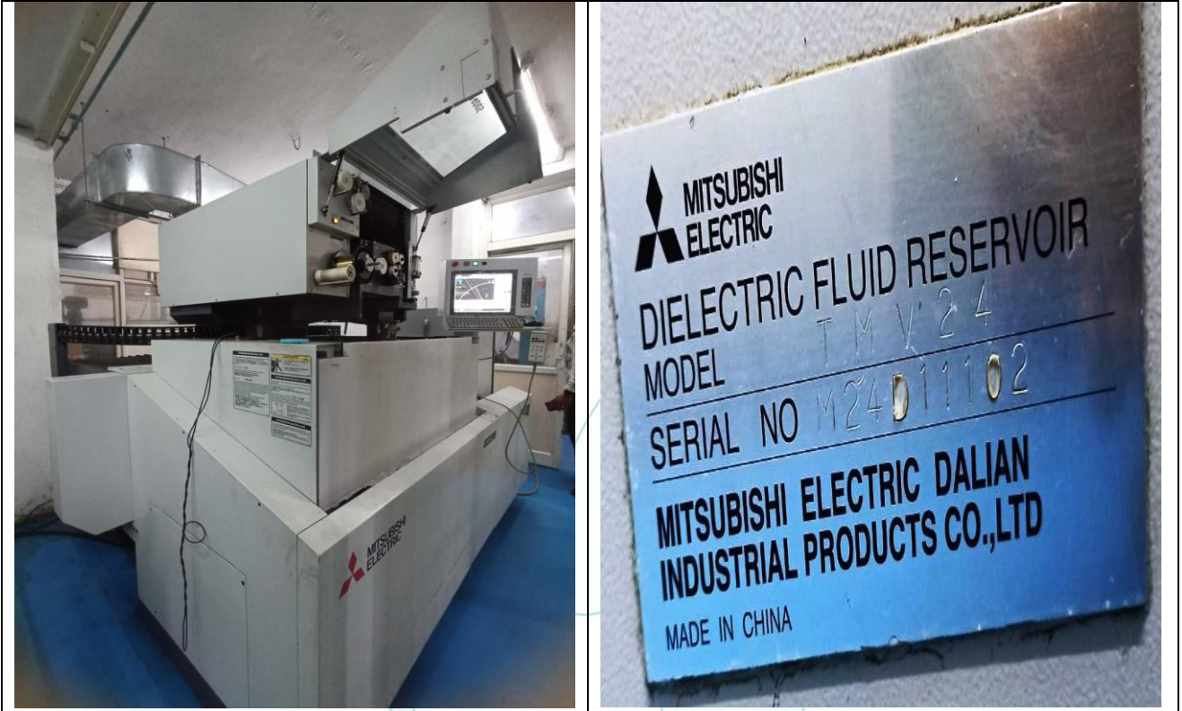
Mitsubishi CNC WEDM Machine model MV2400S, Sr. No.-M24D11102