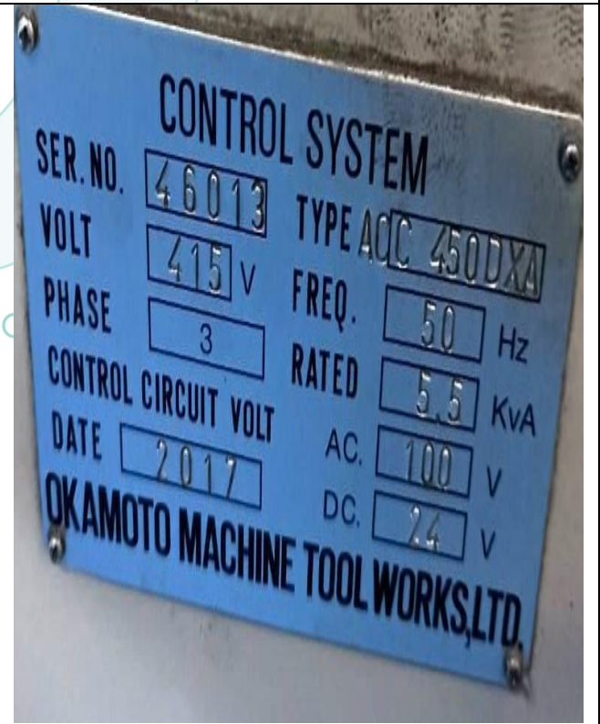
Okamoto Precision Surface Grinding Machine, Sr. No.-46013