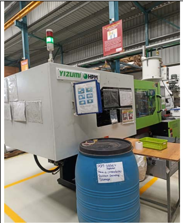
View of 3 Platen Toggle Injection Moulding Machine, Sr. No. INo120I0041