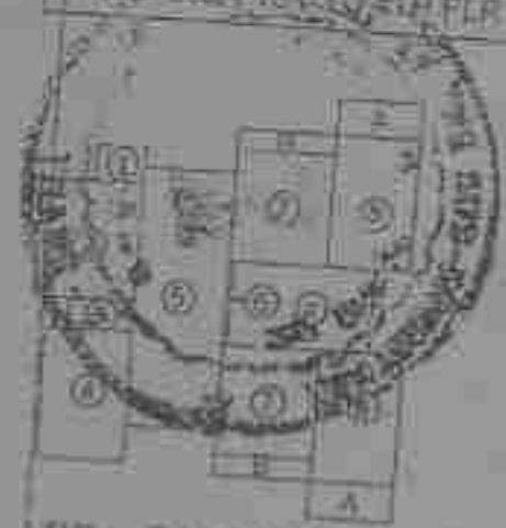
AREA DIAGRAM TYP FLR [1st TO 4th] WING-K SCALE 1:200