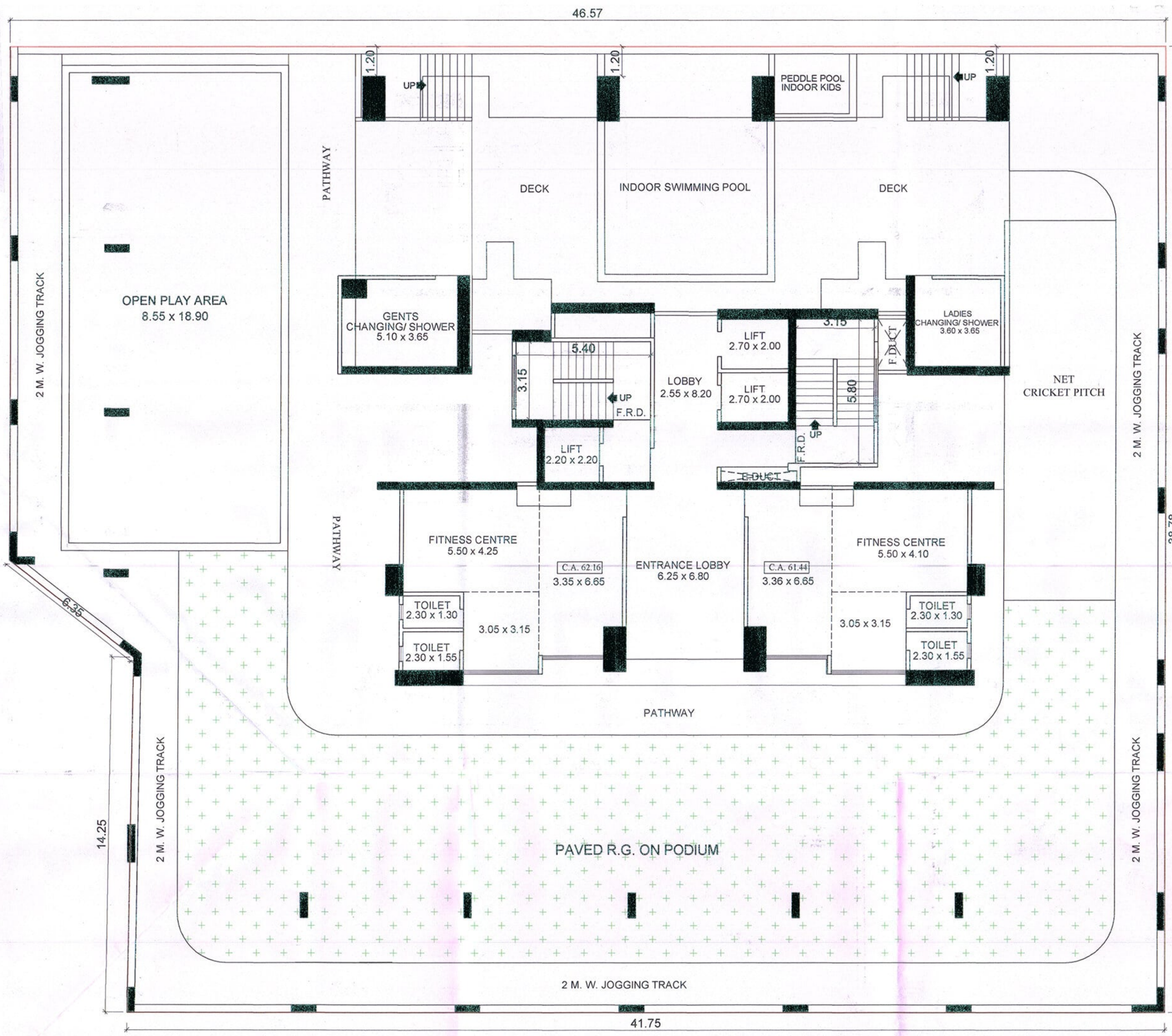
3RD FLOOR PLAN- E-DECK PODIUM BLDG. NO. 5 SCALE: 1:100