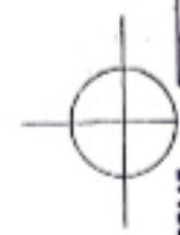
Signature of Sub-Registrar