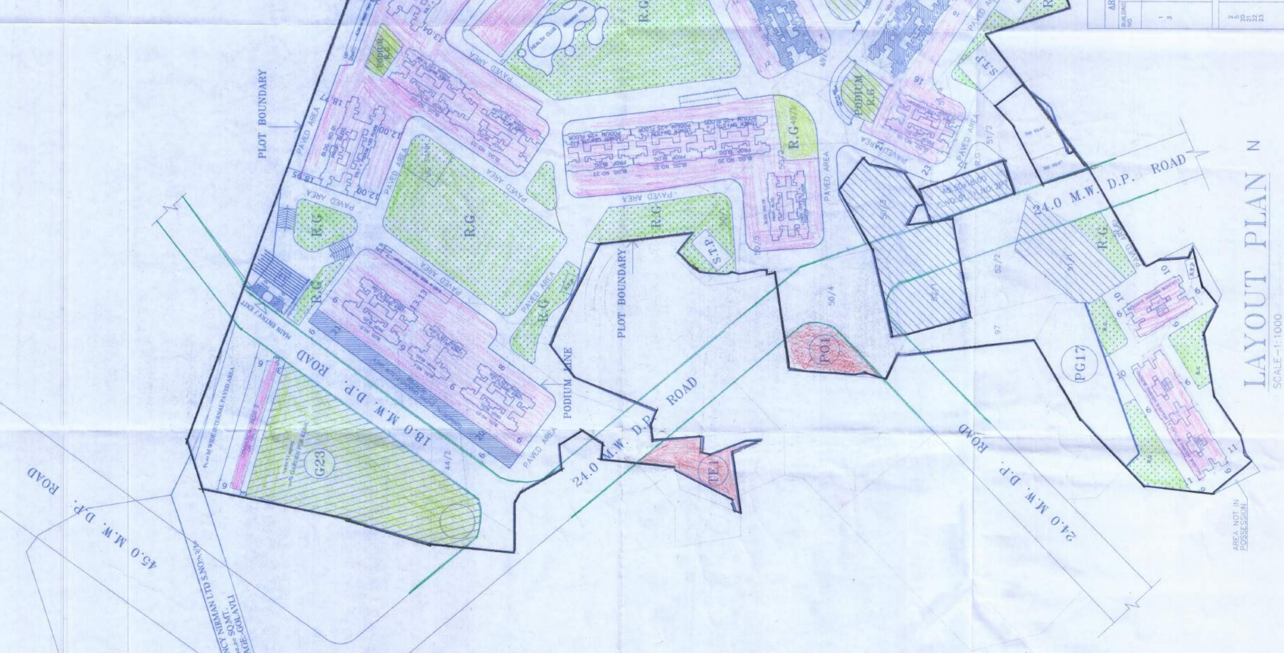
LAYOUT PLAN N SCALE - 1:1000