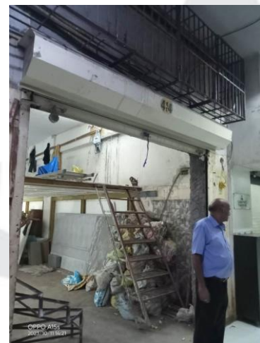
VIEW OF MAIN DOOR