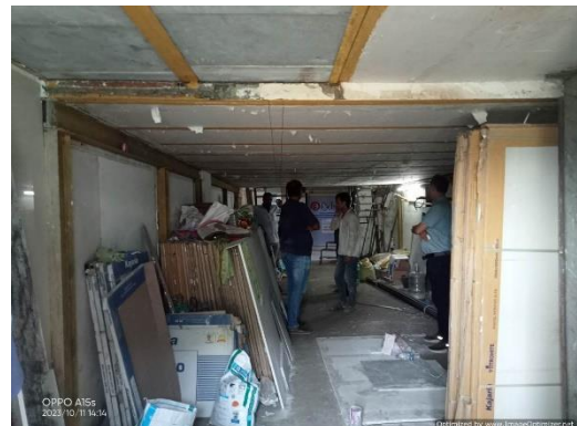
VIEW OF MEZZANINE FLOOR