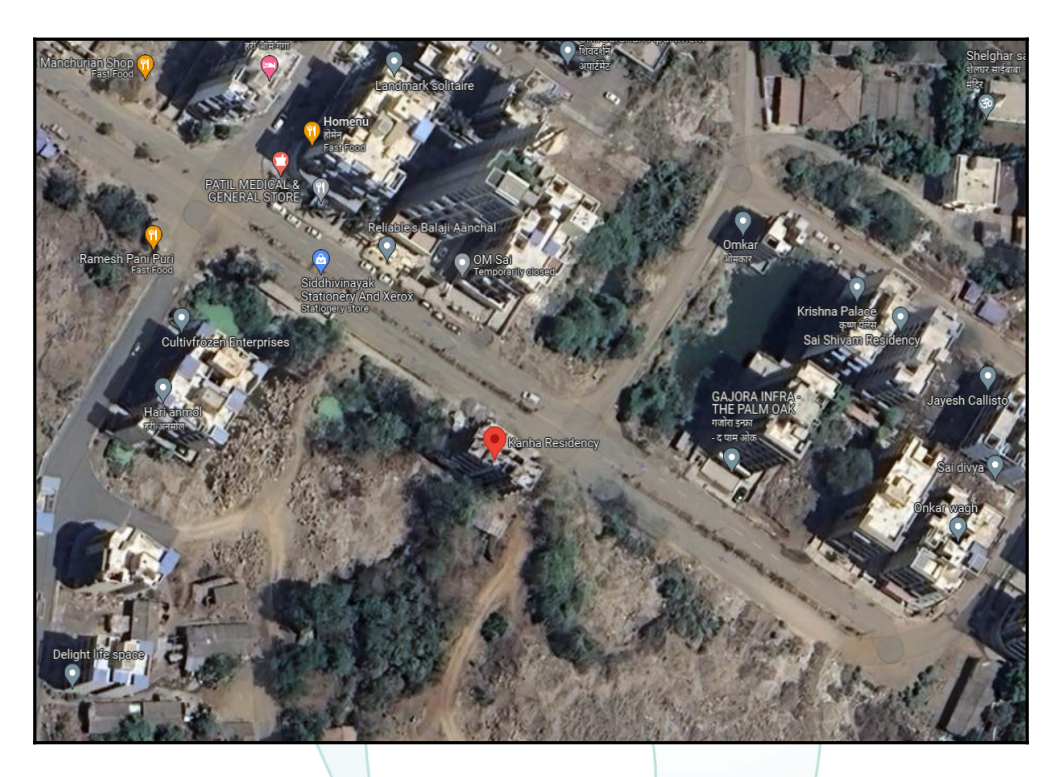
Note: Red marks shows the exact location of the property