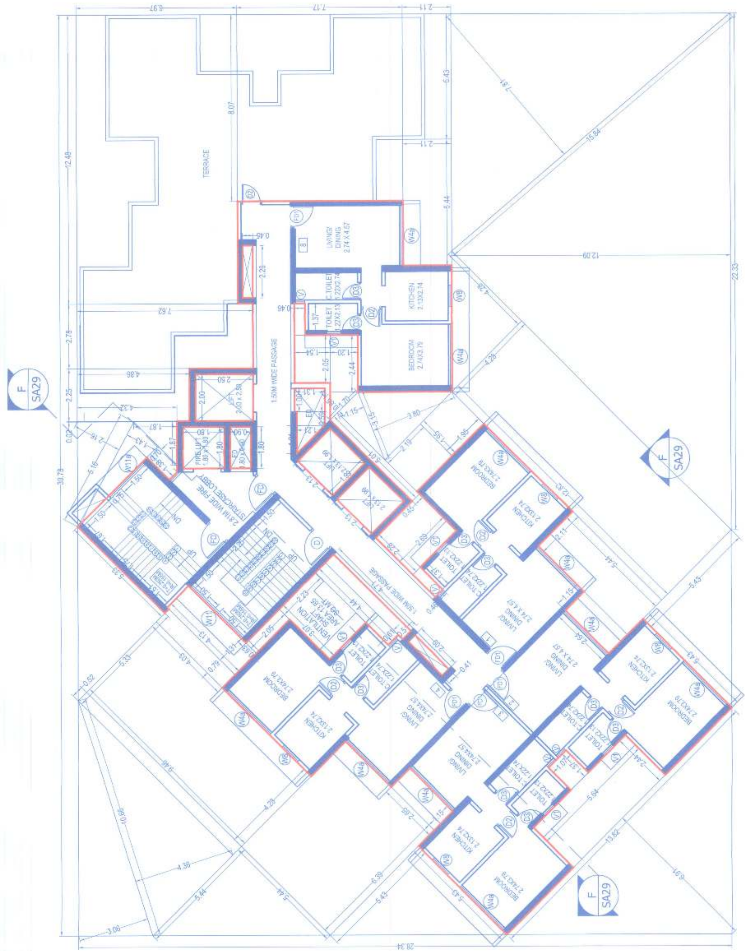
1 27TH FLOOR PLAN Scale: 1:100

एक संरचनात्मक आरेख तैयार करण्यात आला आहे आणि तो सर्व संबंधित कायदा आणि तरतुदी पूर्णपणे पूर्ण करतो. / एक संरचनात्मक आरेख तैयार करण्यात आला आहे आणि तो सर्व संबंधित कायदा आणि तरतुदी पूर्णपणे पूर्ण करतो.