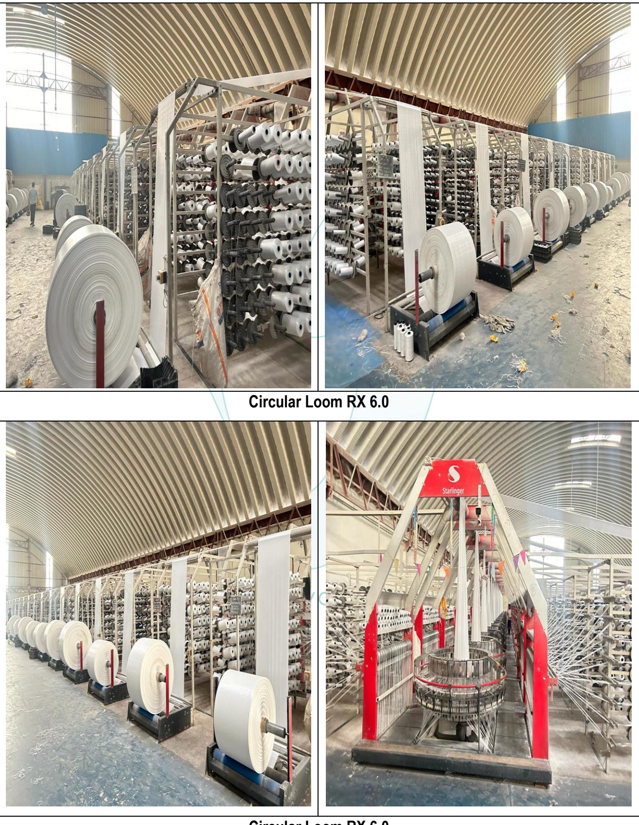
Circular Loom RX 6.0