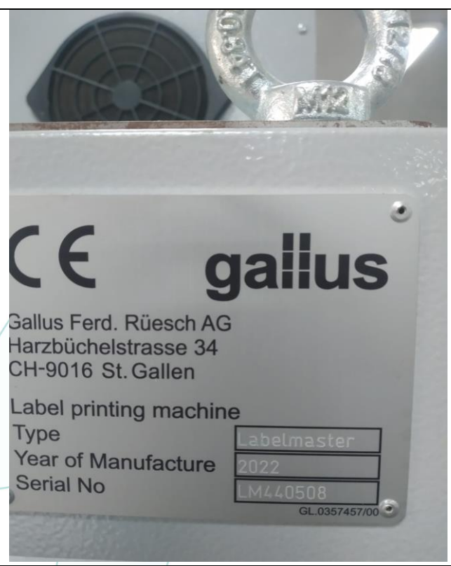
View of Gallus Labelmaster LM440 508 Printing Press with Standard Parts and Accessories