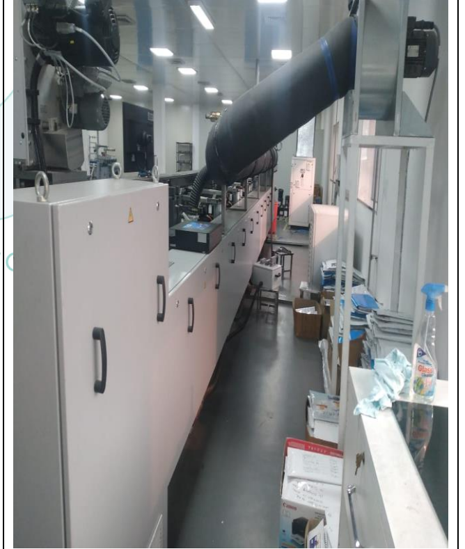
View of Gallus Labelmaster LM440 508 Printing Press with Standard Parts and Accessories