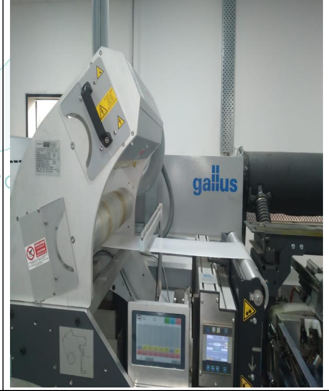
View of Gallus Labelmaster LM440 508 Printing Press with Standard Parts and Accessories