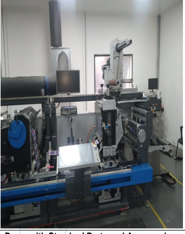
View of Gallus Labelmaster LM440 508 Printing Press with Standard Parts and Accessories